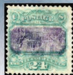
#120b INVERT, Used Fine, tiny faults, only 92 exist, with 3 Certs $19,995