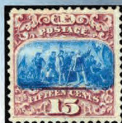
#118a Mint OG VF, only 17 known without grill with Cert $7,995