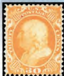
#46 Unused NG with graded XF-90 Cert $9,500