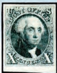
#4 Unused NG with graded XF- Superb-95 Cert $2,595