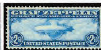
#C13-15 Mint NH each with Graded XF-Superb-95 Certs $3,395