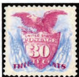
#131 Mint OG with Graded XF- Superb 95 Cert $8,250