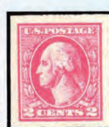
#534B Mint LH with Graded XF- Superb-95 Cert $3,150