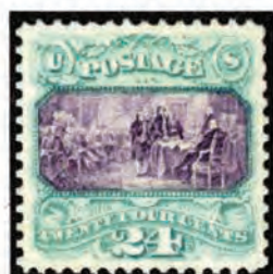
#130 Mint OG with Graded XF- Superb 95 Cert $7,995