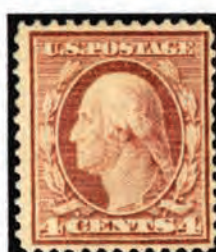
#360 Mint OG Fine, only 93 known, with 2 Certs $24,950