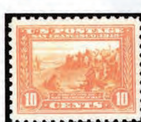
#404 Mint LH with Graded XF-Superb- 95 Cert $1,200