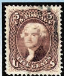
#105 Used with graded XF-Superb- 95 Cert $19,995