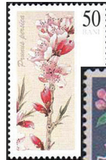
Romania 2011 Peach blossom and Switzerland 1962 Apple blossom