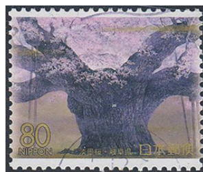
Japan "Mihon" Z277, renowned ancient Cherry tree in bloom