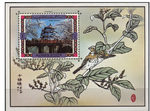
Ajman Cherry Blossoms souvenir sheet, unlisted in Scott