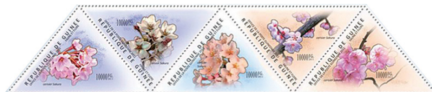
Guinea 2011 Cherry Blossoms set, unlisted in Scott