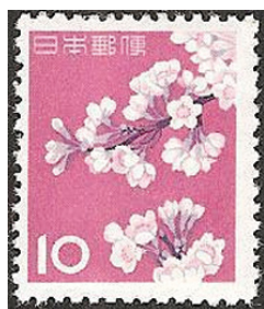
Japan Sc. 725 definitive