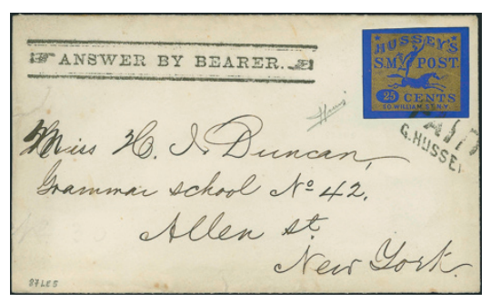
Hussey's 25¢ Gold on Blue Glazed paper Special Delivery (Sc. 87LE5) tied by "Paid/G.Hussey" two-line handstamp with "Answer by Bearer" straightline handstamp on cover to local street address.