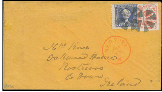
Hussey's (1¢) Red (Sc. 87L25) tied by circle of wedges and used with 1869 6¢ Pictorial (Sc. 115) on cover to Ireland, with red "New York Jan. 29" circular datestamp.