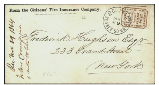
Hussey's 2¢ Brown, Dated 1863 (Sc. 87L35) tied by "2 Ct. Paid Hussey 50 Wm. St. Nov. 29" circular datestamp on 1864 insurance company corner card cover to local street address.