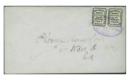
Hussey's Black on wove paper (Sc. 87L43). pair tied by purple "Hussey's Special Messenger Express Paid, 54 Pine St." double-line oval handstamp on cover to Wall St. local street address.