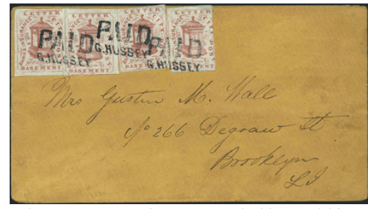
Hussey's 1¢ Brown Red (Sc. 87L4) tied by "Paid/G. Hussey" two-line handstamp on cover to Brooklyn street address, with an insurance company address on the flap.

Hussey's (1¢) 1857 Black "82 Broadway" stamp (Sc. 87L2) tied by "Paid/G. Hussey" two-line handstamp, used in combination with Hussey's Post, 1858 "50 William St." black handstamp (Sc. 87LUP2) on cover to local street address with insurance company address on the flap, docketed May 8, 1858. Hussey moved to William St. in mid-1857.