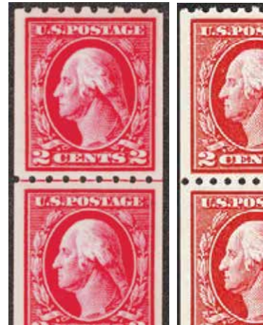
411 VF NH Line Pr, SCV $125, net $69