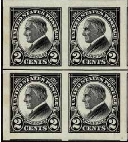
611 Superb NH Jumbo Margins, SCV $130+++ ($758 based pm Singles SCV), net $60