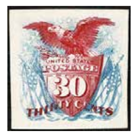
121P4 VF LH SCV $170 Stamp SCV $4,000, net $120