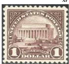
571 XF NH XF SCV $130, net $95