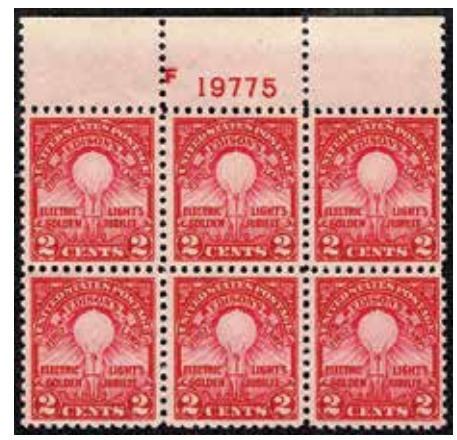
654 Plate Block, FVF+ NH, SCV $40, net $34