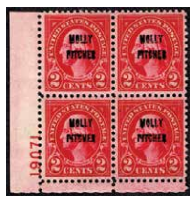
646 Plate Block, FVF NH, Immaculate gum, Light erasure in margin, SCV $52.50, net $19