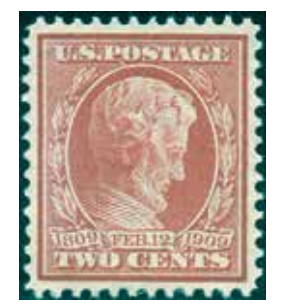
369 XF-S, Very LH Bluish paper, rare this nice XF-S SCV $275, net $225