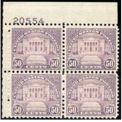
701 Plate Block, Fine-Very Fine, Never Hinged, Full, intact perfs all around, bright color SCV $230, net $155