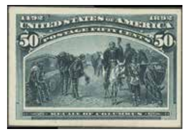
240P4 VF, No Gum As Issued, LH Proof SCV $200. O.G. Stamp SCV $400, net $90