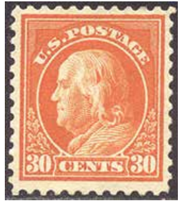
516 FVF NH SCV $70, net $35 Also available, LH $17.50