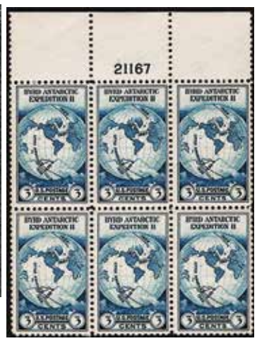
733, FVF NH, wide top, SCV $15+, net $12.50