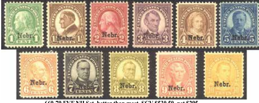
669-79 FVF NH Set, better than most, SCV $530.50, net $295