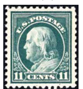
511 VF NH, SCV $17, net $15