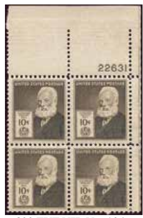
893 FVF NH, Net $24 (sample photo) Also available, complete set, FVF NH, $89