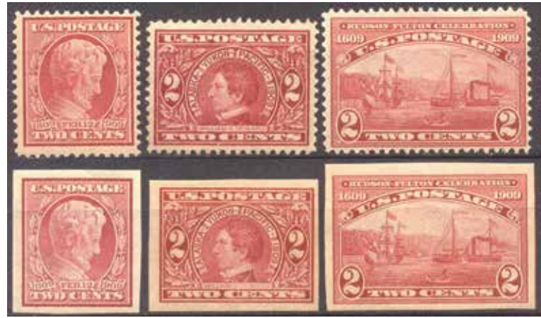
367-68, 370-73 (no 369 Bluish paper), FVF-VF NH, Nice, clean, fresh set (example) SCV $139, net $79