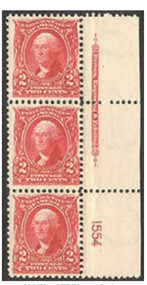
301 Fine NH Plate # Strip, Immaculate gum, strong perfs SCV $120, Net $60