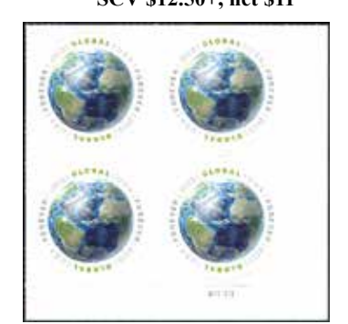
4740 FVF NH PB of 4 SCV $9, net 7.50 Also available, PB of 8 with Top Label, SCV $18, net $15