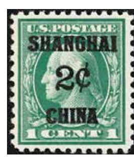
K1 VF NH SCV $67.50, net $52.50