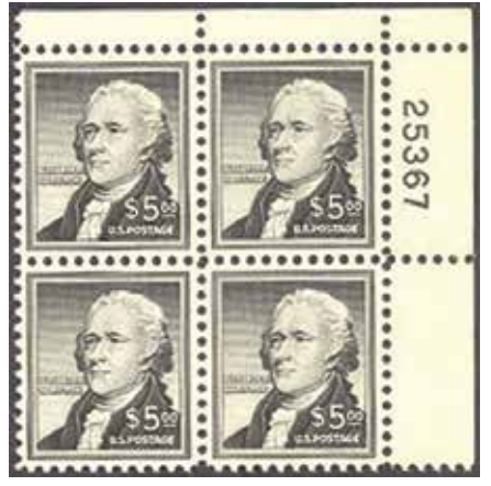
1053 Plate Block, FVF NH, SCV $210, net $135