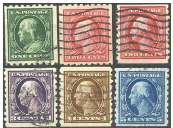
390-396 Used, Very Fine, Nice, Balanced Set, Better Than Most SCV $354, net $145