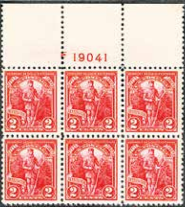
643 Wide Top Plate Block, FVF NH SCV $45.00, net $19