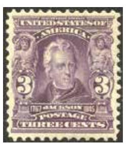
302 XF NH Bright, fresh & sharp XF SCV $375, net $175