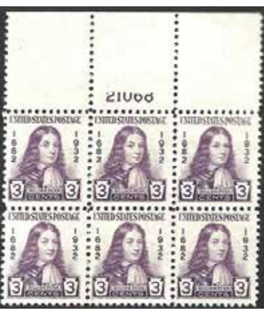
724 Wide Top Plate Block, FVF NH SCV $12.50+, net $11