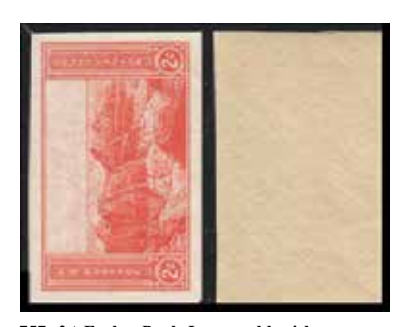
757, 2¢ Farley Park Issue, sold with no gum, then USPO offered to apply gum. I have a few NH examples that can serve as reference copies. While SCV is $1.75, just try to find them outside of $114 SCV 756-65 sets.

Buy a set of 756-65 Parks Imperfs, no gum as issued, SCV $15.50, for $9.50 and you can add $2 for a P.O. applied NH original gum single; Or an O.G. NH single alone for $5