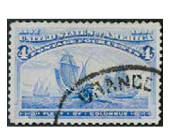
233, XF-Sup, neat c.d.s. XF-Sup SCV $200, net $49