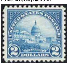
572 FVF+ NH SCV $120, net $69