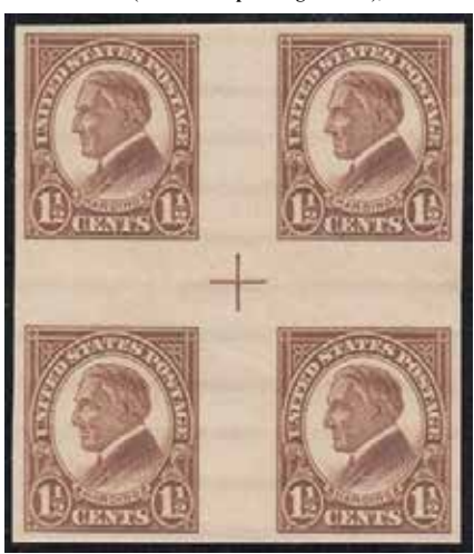
631 VF NH Cross Gutter Block, VF NH, with Gum Ridges, per Scott Standard, SCV $35, net $31