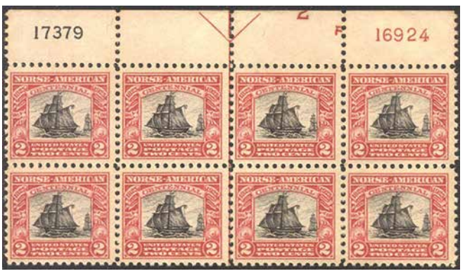
620 Plate Block, FVF NH, Bright & Fresh, Better than Most SCV $275, net $135