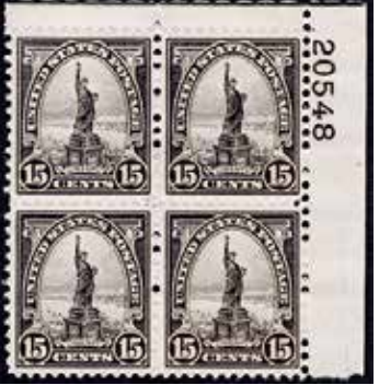
696, FVF NH, SCV $55, net $40.00