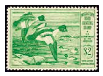
RW16 VF NH, SCV $70, net $45