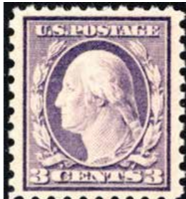
464 XF-Superb NH, Immaculate Gum XF-S SCV $1,100, net $275