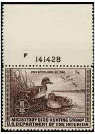
RW6 VF NH Wide Top Plate # Single SCV $250+, net $140.