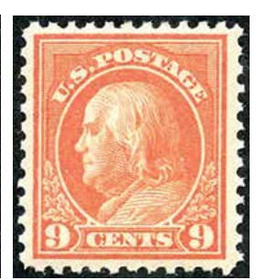
509 VF NH, SCV $25, net $19