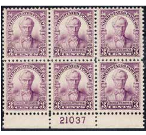
725 Plate Block, FVF+ NH, SCV (undervalued) $20, net $20