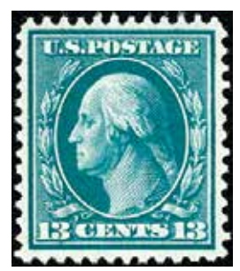
339 XF LH XF SCV $60, net $41