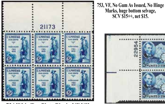
734 Wide Top Plate Block, VF NH SCV $28++, net $22