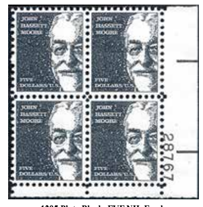
1295 Plate Block, FVF NH, Fresh SCV $42.50, net $24