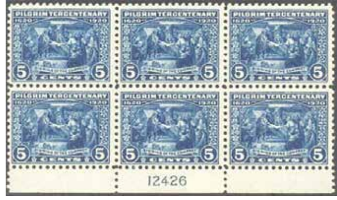
550 Plate Block, FVF VVLH in selvedge, margin perf sep SCV $425, net $125