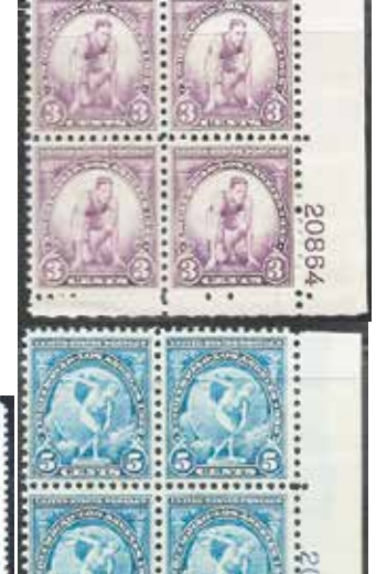
718-719 FVF NH, SCV $42, net $32

Marks, huge bottom selvage, SCV $15++, net $15.