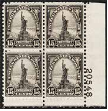
696, VF NH, SCV $55+, net $45.00