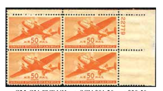
C25-C31 FVF NH set, SCV $81.20, net $39.50 Also available, C31 alone, SCV $47.50, net $26