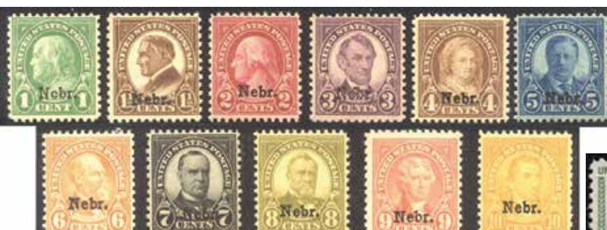
669-79 FVF LH Set, better than most, SCV $265.25, net $145