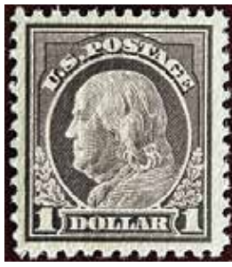
518 VF-XF NH, immaculate gum, full perfs all around, with PSE Certificate grading it VF-XF 85 NH. VF-XF SCV $110, net $90