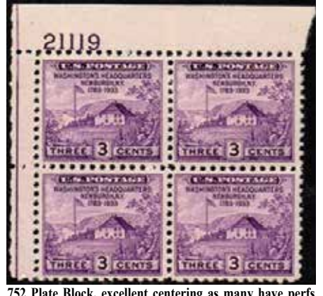
752 Plate Block, excellent centering as many have perfs cutting design, immaculate reverse, Never Hinged, no gum as issued with no signs of prior hinging. SCV $27.50++, net $29