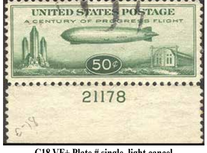
C18 VF+ Plate # single, light cancel SCV $47.50+, net $42