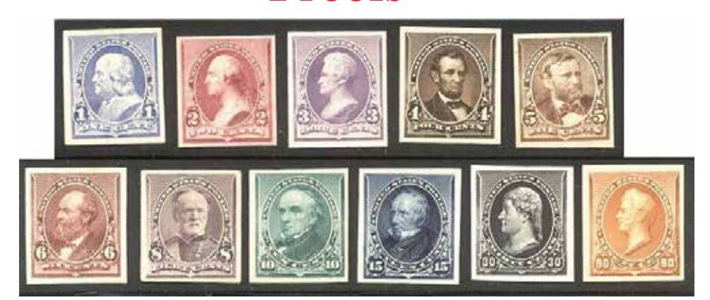
A Very Fine set of the 1891 Small Bank Note Design Types Proofs, Sc. 219P4//229P4 (the 2¢ is the Lake 219DP4) in Rare Condition, NH, Some LH. SCV as Proofs is $585, the Stamp Set SCV is $1,400 without XF premiums. Net for this Premium Condition Proof Set is $495.