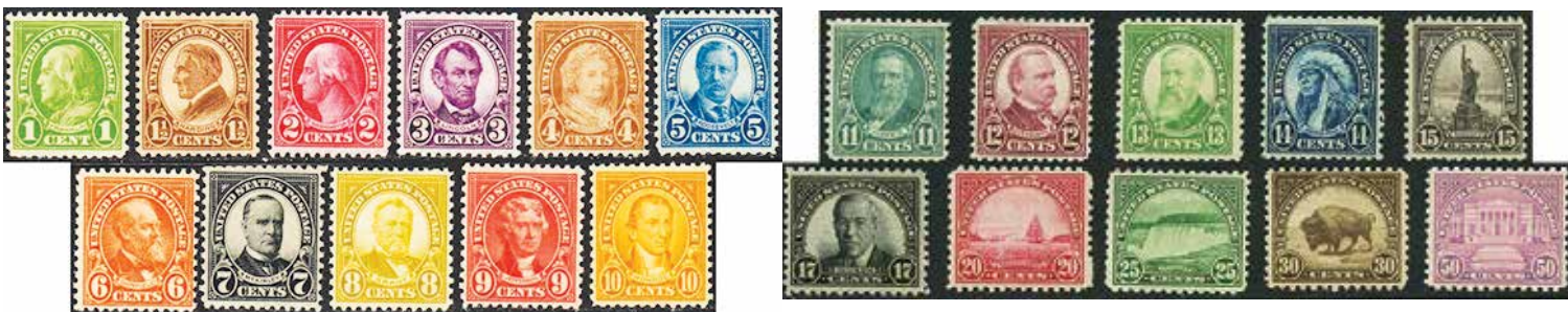
632-642 FVF NH, SCV $28, net $18