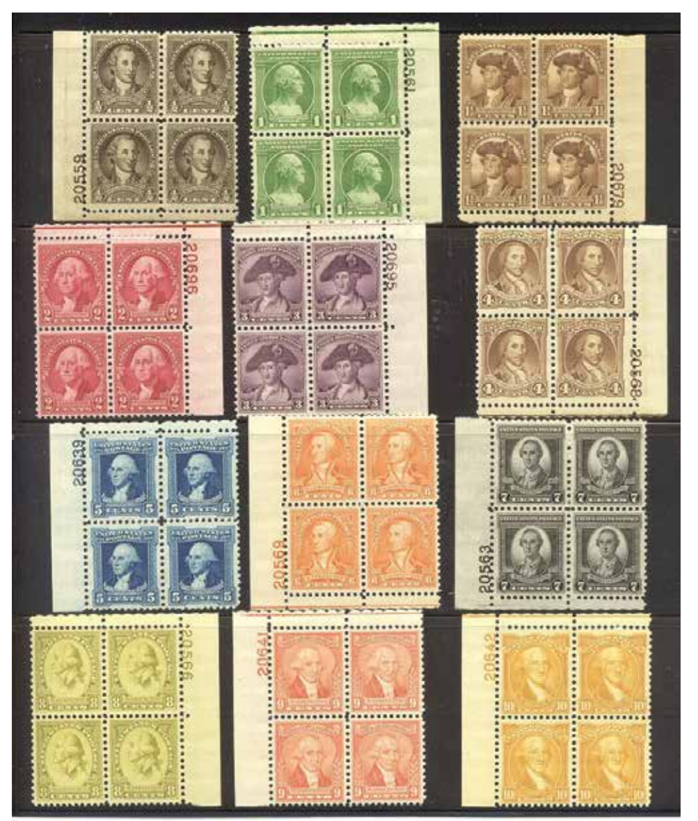
704-715 Plate Blockset, Fine-Very Fine, Never Hinged, much better than most Bright & fresh, full perfs all around, nice balanced set. SCV $391, net $225