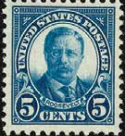
557 VF NH, wide margins SCV $35+, net $24