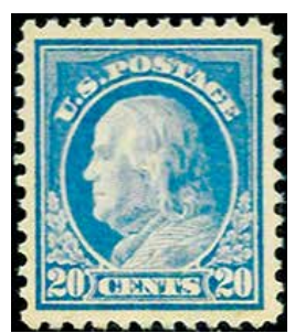
515 Superb LH Superb SCV $245 (XF-S $130), net $95