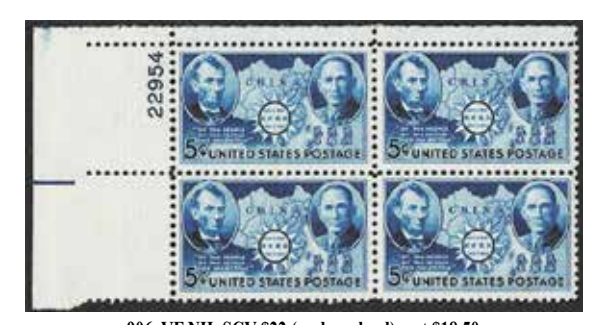
906, VF NH, SCV $22 (undervalued), net $18.50.