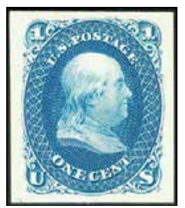
63P4 XF LH, no gum as issued, Stamp SCV $650, Proof SCV $50+, net $59