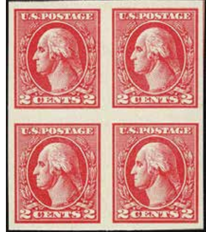
534 XF NH Block, Immaculate gum, strong color, Clear Type Va Identifaction characteristics XF SCV $160, net $120 (Pairs $70)