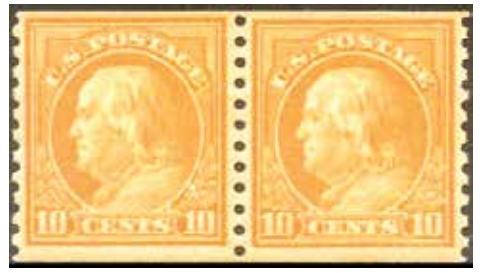
497 FVF NH Pair, Deep Rich Color. SCV $85, net $39