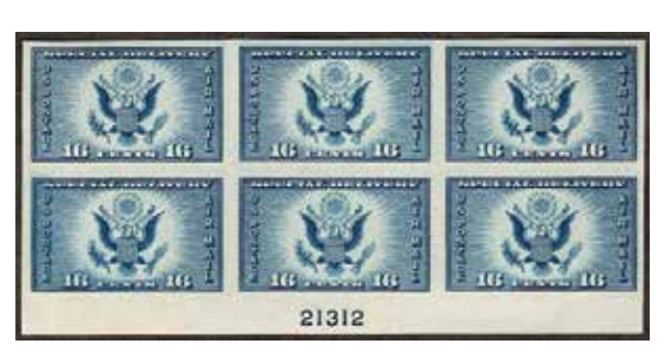
771 FVF NH No Gum As Issued, No Hinge Marks or Wrinkles SCV $55, net $32