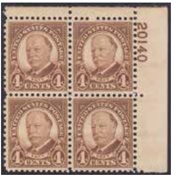
685, FVF NH, SCV $20, net $15.00