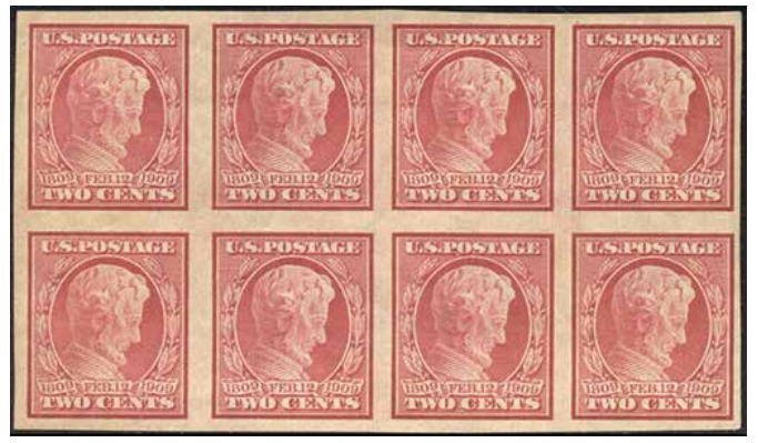
368 Scarce Combination Block: Left block 3mm spacing, right block 2mm spacing VF NH Light natural gum skips, less than usual; SCV $230, net $125