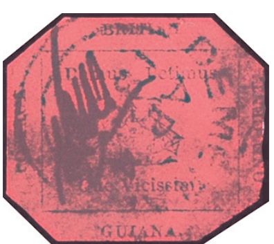
The One Cent Magenta British Guiana, Sc. 13

Although in point of size and commercial importance, British Guiana is essentially a small colony, it holds a high place in the esteem of philatelists on account of the number of rare stamps found among its earlier issues. Not only is it one of the most expensive countries to collect, but it also has the honour of having issued the rarest stamp in the world. This is the 1 cent black on magenta, of 1856, only one copy of which is known. This rare specimen, which reposes in the famous collection of Herr Phillip von Ferrary, of Paris, is without exaggeration the most valuable piece of paper for its size in the world.