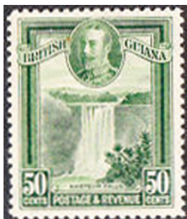
Brit. Guiana 213

The greater part of British Guiana is covered with a dense forest growth intermingled with undulating savannas, or grasslands, and bare tablelands here and there, culminating in mountain ranges to the south. The many rivers afford the only means of transportation into the interior, chief among them being the Courantyne and the Essequibo. On the Potaro, a tributary of the Essequibo, is the beautiful Kaieteur Falls, 822 feet high (Scott 213).