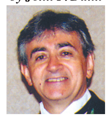
Mekeel's & STAMPS July 25, 2014