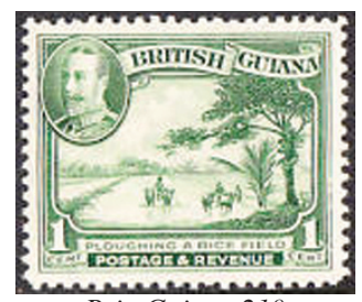
Brit. Guiana 210, plowing rice field