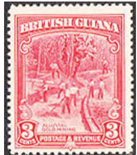
Brit. Guiana 212, gold mining

following year they were recaptured and captured several times and it was not until 1814 that they were formally ceded to Britain. In 1831 Britain consolidated Demerara, Esseguibo and Berbice into one colony, the only British possession on the South American continent.