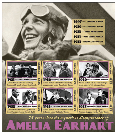
Flight pioneers is another category. Featured on our front cover is a 2013 Grenada souvenir sheet honoring the achievements of Amelia Earhart.