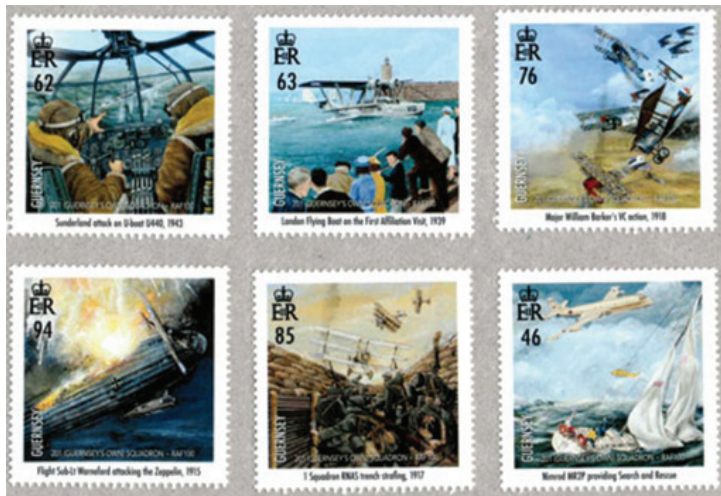
The role of the airplane in warfare as well as in service is marked on a 2018 set of stamps from Guernsey