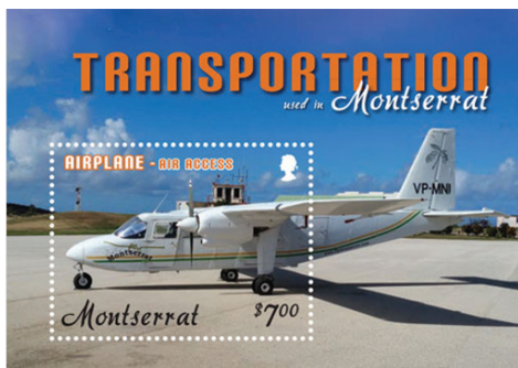
In similar fashion, many island nations depend on local airlines for transportation and supply needs, a subject that is recognized by Montserrat on a 2016 souvenir sheet.