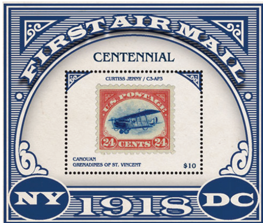
A 2018 souvenir sheet from the Canouan Grenandines of St. Vincent depicts a familiar subject, the first U.S. Airmail issue.

Shown here is a sampling of issues on the site, www.igpc.com —with even more that go back for a number of years and are still available.