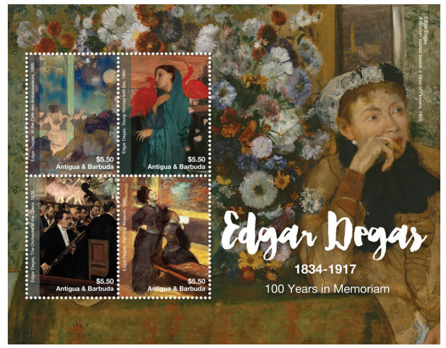
Edgar Degas masterpieces, from Antigua & Barbuda

Illustrated here are a few examples of beautiful works of art that can be collected on stamps from around the world. These examples are among the many Art Topicals that were issued by client nations of the Inter-Governmental Philatelic Corp. To view hundreds of other Art issues, please visit the IGPC website, <u>www.igpc.com</u>.