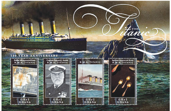
Ghana sheetlet, Sc. 2697, issued September 7, 2012

For them, we turned to the website of the Inter-Governmental Philatelic Corp., www.igpc.com . One of the leading philatelic agents, representing many nations, IGPC often focuses on popular topical issues. We present a sampling, and refer you to www.igpc.com to view many additional Titanic issues.