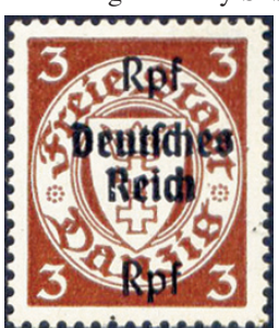
Danzig Sc. 244, with German Administrazig Sc. 168