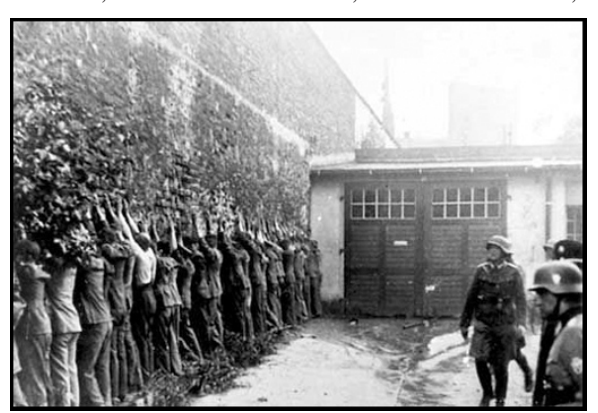
"marched" over to the former Prussian rifle range in the vicinity of Zaspa, near Wrzeszcz, where they were mowed down with machine-gun fire by S. S. Troopers.

The sentence of death was carried out October 5, 1939. The valiant Poles, most of them wounded, burned and maimed, were