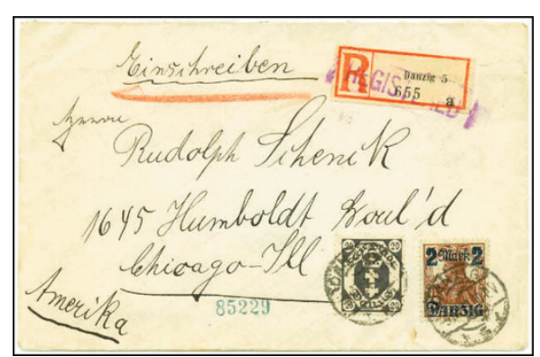
Danzig 1921, registered cover to U.S. with 1920 2 mark on 35pf, Sc. 27, and 1920 20pf, Sc. 66

At first, due to a provisional agreement between the representatives of the Free City of Gdansk and Poland, the first Polish post office was established at Danzig October 10, 1920, and was named "Urzad Ekspedycji Pocztowej" (Office of Postal Expediting). The duties of this postal service were the receiving of parcels from United States and elsewhere and the forwarding beyond the Polish border of parcels and bags of mail by seaways.