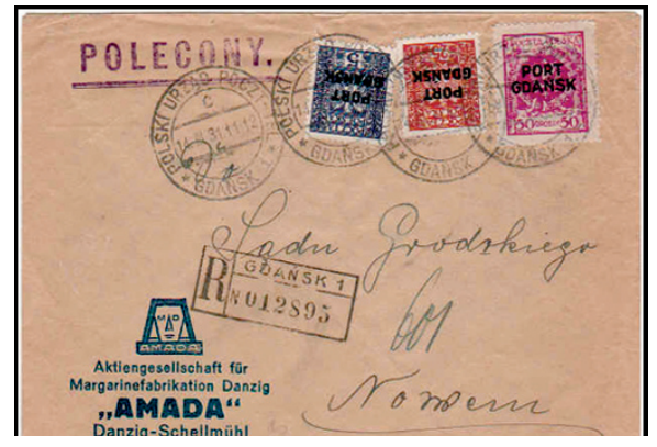
Polish Danzig 1931, registered commercial cover with "Port Gdansk" overprints, Sc. 1K20, 22, 11