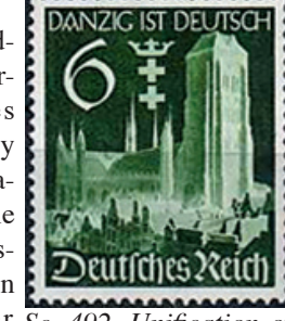
today, after \overline{Sc.492} , Unification of careful search, Danzig stamp, issued remains un- by Germany September tion overprint on Dan- known. The 18, 1939 immediately grateful Pol-following the fall of ish Govern- Danzig.