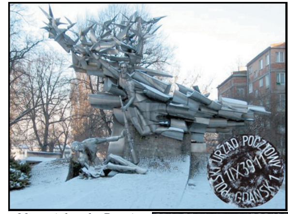
Memorial to the Danzig postal workers and 1979 stamp picturing the Memorial, Sc. 2354

mailmen and postal employees with two commemorative stamps: one in 1946 (left), and the second in 1958 (right).