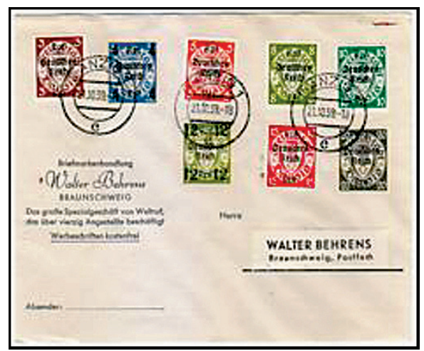
1939 cover with stamps issued under German Administration following the fall of Danzig, Sc. 241 / 250

ment, in recognition of the valiant and above duty defense of the Gdansk Polish Post Office, decorated the standard of the "Postal, Telegraph and Telephone Workers Alliance" with the order of Virtuti Military V class.