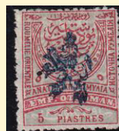
Eastern Rumelia 24 F-VF H 3-Toe Type B, Signed $750.00