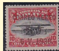
Bolivia C13 VF LH Brown Ovp't $1,900.00