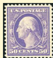
341 VF-XF NH PSE Cert. $800.00

1,000's of better US and Worldwide listed: