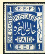
Palestine #1 VF NH $160.00