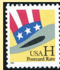
3269v F-VF/ NH "H" Yellow Hat Unissued— inscribed "Postcard Rate" $2,000.00

We have just what you are searching for to enhance your collection or add to your exhibit.