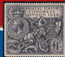
Great Britain PUC £1 209 VF H $500.00