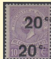
Monaco J19a Fine/NH Double ovp't. Behr Cert. $650.00