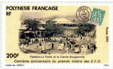
Fig. 34: 1992 centenary of 1st stamps for French Oceanic Settlements (Sc. 605)