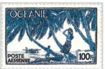
Fig. 45: 1944 Vichy government air post stamp, never put on sale in FOS (Sc. C18)