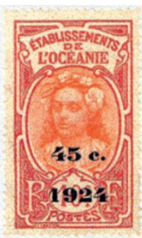
Fig. 35: Left to right: 1913 Tahitian girl (Sc. 22); 1996 Stamp Day reproducing 1913 stamp (Sc. 693); 1924 provisional (Sc. 64)