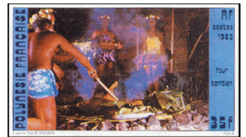
Fig. 72: 1985, Local foods: pit fire (Sc. 423)