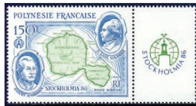
Fig. 61: 1986 showing map of Tahiti and two Swedish scientists who accompanied Captain Cook (Sc. C219)