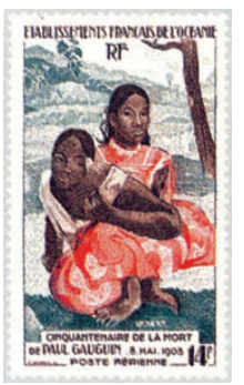
Fig. 48: 1953 air post for 50th death anniversary of Paul Gauguin (Sc. C21)