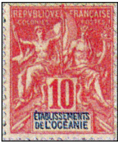
Fig. 32: 1900 French Oceanic Settlements (FOS) (Sc. 7)