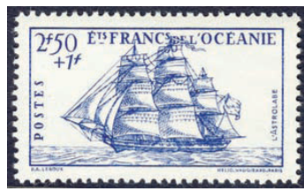
Fig. 43: 1941 Vichy semi-postal (Sc. B12A), never put on sale in FP