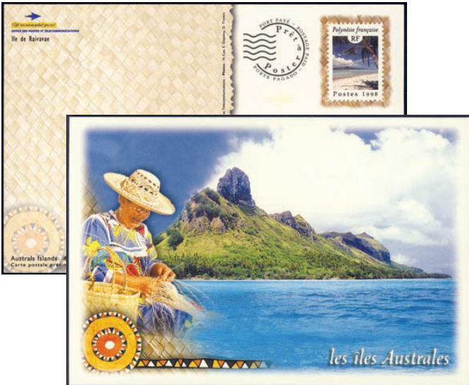
Fig. 50: 1998 pre-stamped postal card dedicated to the Austral islands, and showing Raiivavae island