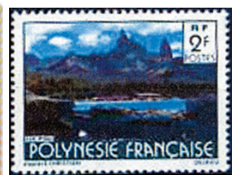
Fig. 59: 1979, Mountain peaks, Ua Pou, Sc. 314