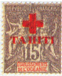
Fig. 33: 1915 Tahiti semi-postal overprint on FOS (Tahiti Sc. B2)