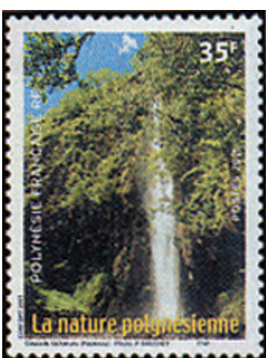
Fig. 55: 2001, Vaiharuru Waterfall, Sc. 794