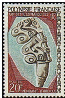
Fig. 57: 1967, Art of Marquesas Islands, earring, Sc. 233