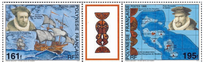
Fig. 54: 1995 400th anniversary of discovery of Marquesas Islands (Sc. 665)