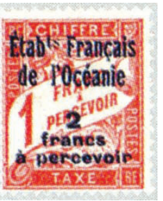
Fig. 37: 1926 postage due (Sc. J7)