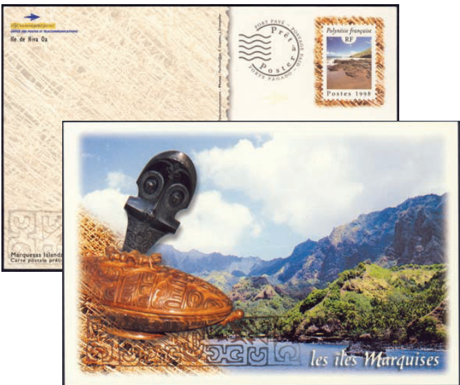
Fig. 53: 1998 pre-stamped postal card dedicated for the Marquesas Island and showing a view from Hiva Oa island