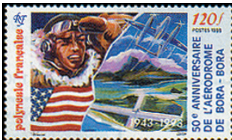
Fig. 73: 1993, 50th Anniversary, Allied airfield on Bora-Bora (Sc. 615)