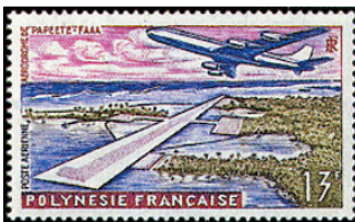
Fig. 69: 1960 airmail, plane over Papeete airport (Sc. C28)