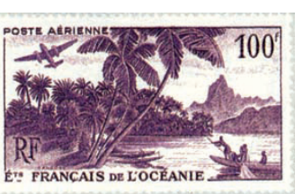
Fig. 47: 1948 air post fishermen (Sc. C18)