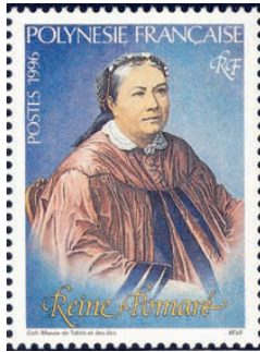
Fig. 63: 1996 Queen Pomare (Sc. 678)