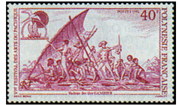
Fig. 53: 1992 for 6th Festival of Pacific Arts, Raratonga, Sc. 603