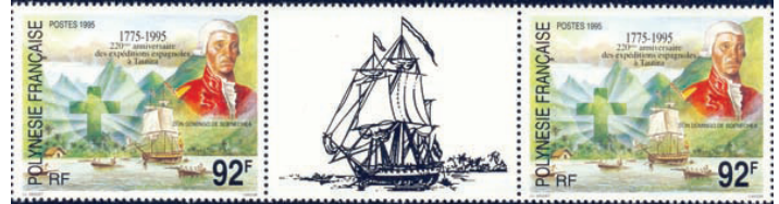
Fig. 64: 1995 for 220th anniversary of Don Domingo de Boenechea's expedition to Tautira (Sc. 653)