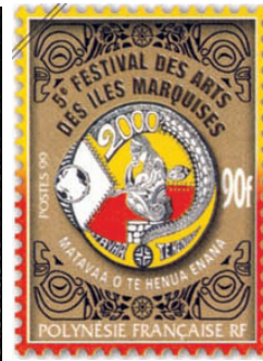
Fig. 58: 1999 for 5th Marquesas Islands Arts Festival (Sc. 769)