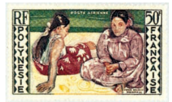
Fig. 49: 1958 "Women of Tahiti" by Gauguin (Sc. C25)