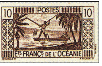
Fig. 42: Left, 1913 FOS Tahitian girl (Sc. 21); right, 1942 Vichy government re-issue of 1934 definitives without "RF" upper right, never placed on sale