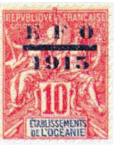
Fig. 36: 1915 provisional (Sc. 55)