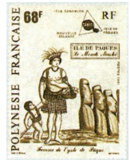
Fig. 68: 1991 Maori world, here Easter Island (withdrawn after short time on the demand of Chile) (Sc. 560)