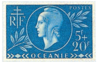
Fig. 41: 1944 Free French semi-postal (Sc. B13)