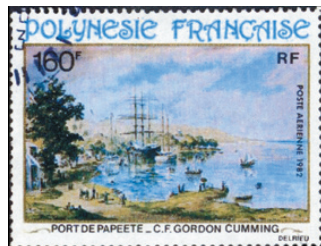
Fig. 66: 1982 paintings, Papeete Harbor, by C. F. Gordon Cumming (Sc. C197)