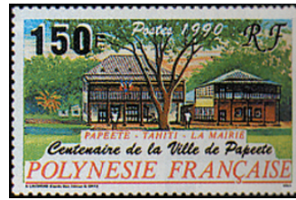
Fig. 67: 1990 Centenary of Papeete township, new town hall (Sc. 538)