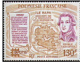
Fig. 51: 1987 airmail with map of Rapa, George Vancouver and excerpt of ship's log, Sc. C225