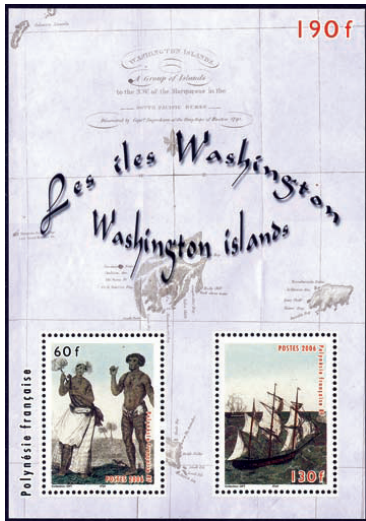
Fig. 60: 2006 for discovery of Washington Islands, 1791 (Sc. 918a)