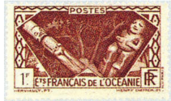
Fig. 38: 1934 FOS Idols (Sc. 103)