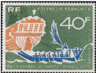
Fig. 65: 1968 Explorer's ship and canoe, for bicentenary of discovery of Tahiti (Sc. C45)