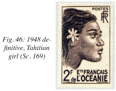
Fig. 46: 1948 definitive, Tahitian girl (Sc. 169)