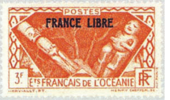
Fig. 39: 1941 "Free French" overprint (Sc. 129)