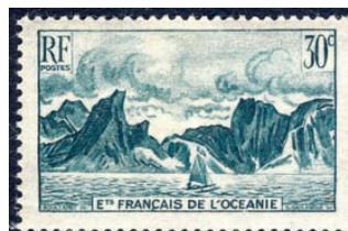
Fig. 62: above, 1948, Coast of Moorea (Sc. 161); right, Mt. Aorai and Mt. Orohena (Sc. 783)