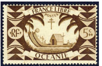
Fig. 40: 1942 Free French (Sc. 136)