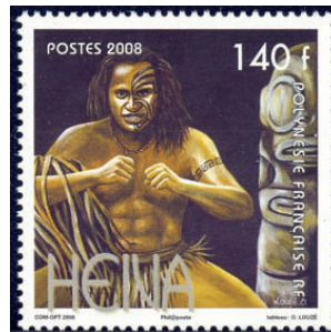
Fig. 71: 2008 Heiva Festival, Tattooed man, (Sc. 978)