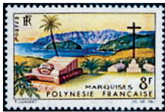
Fig. 56: 1964, Gauguin's tomb, Marquesas, Sc. 214