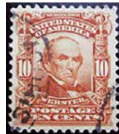
307, XF, Moderate ccl, Portrait Shows, XF SCV $55, net $19.