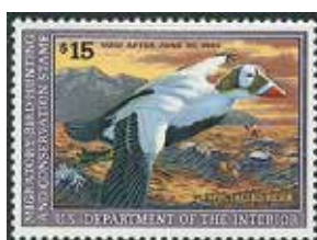
RW59, XF NH, XF NH SCV $37.50 net $25