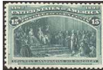
238 VF NH SCV $600, net $295