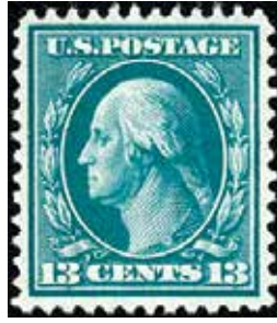
339 XF LH XF SCV $60, net $41