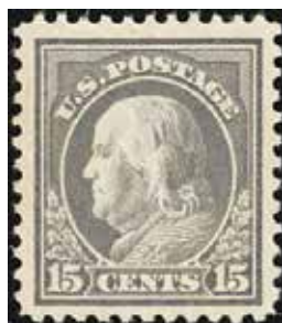
514 VF-XF NH, wide margins VF-XF SCV $105, net $85