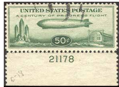
C18 VF+ Plate # single, light cancel SCV $47.50+, net $42