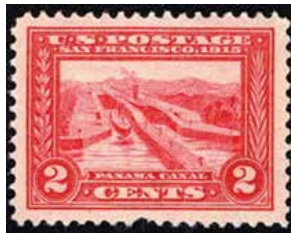
398 Superb Centering, pulled perf SCV $16, Superb SCV $525, net $12