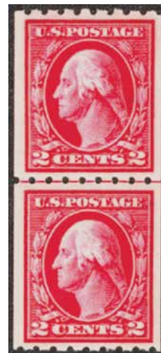
411 VF NH Line Pr, SCV $125, net $69