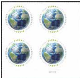
4740 FVF NH PB of 4 SCV $9, net 7.50 Also available, PB of 8 with Top Label, SCV $18, net $15