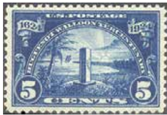
616 XF NH, light natural gum wrinkle XF SCV $79, net $28