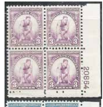
718-719 FVF NH, SCV $42, net $32