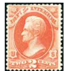
O16, FVF O.G., hinge remnants as often, blunt perfs, SCV $70, net $19