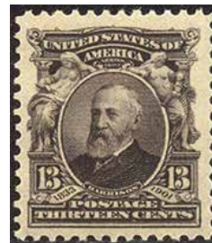
308 XF LH XF SCV $70, net $59