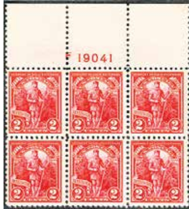
643 Wide Top Plate Block, FVF NH SCV $45.00, net $19