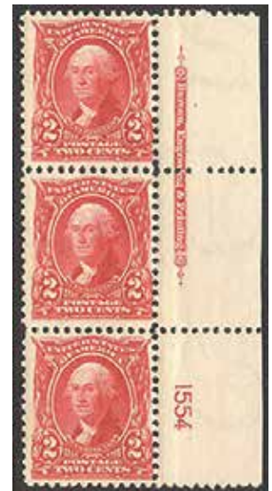
301 Fine NH Plate # Strip, Immaculate gum, strong perfs SCV $120, Net $60