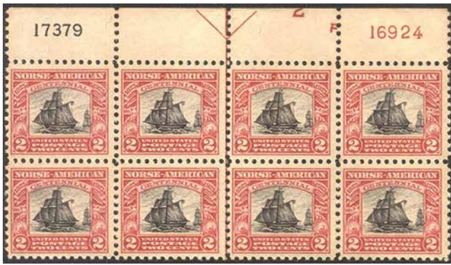
620 Plate Block, FVF NH, Bright & Fresh, Better than Most SCV $275, net $135