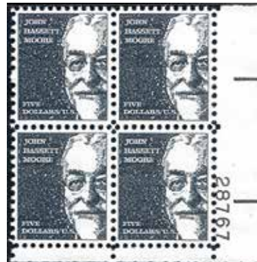
1295 Plate Block, FVF NH, Fresh SCV $42.50, net $24