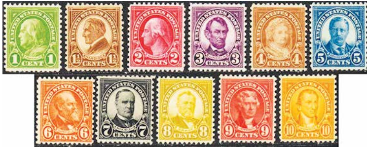
632-642 FVF NH, SCV $28, net $18