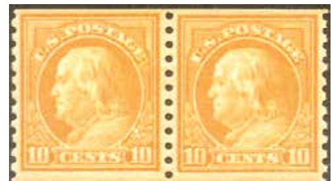
497 FVF NH Pair, Deep Rich Color. SCV $85, net $39