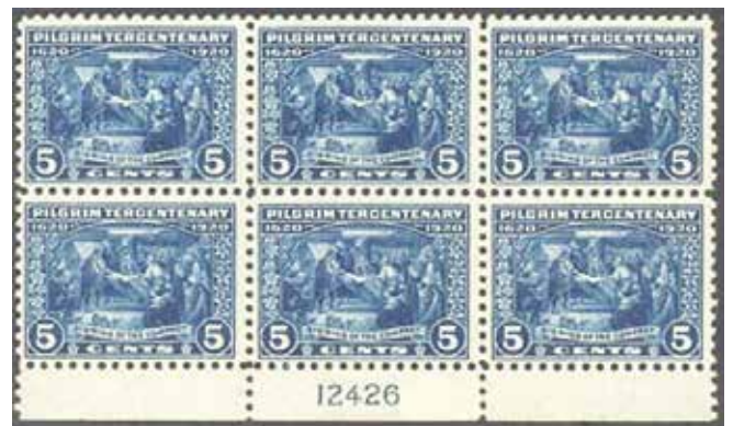
550 Plate Block, FVF VVLH in selvedge, margin perf sep SCV $425, net $125