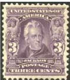
302 XF NH Bright, fresh & sharp XF SCV $375, net $175