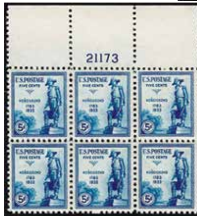
734 Wide Top Plate Block, VF NH SCV $28+, net $22