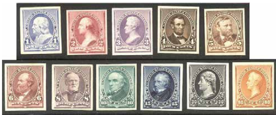
A Very Fine set of the 1891 Small Bank Note Design Types Proofs, Sc. 219P4//229P4 (the 2¢ is the Lake 219DP4) in Rare Condition, NH, Some LH. SCV as Proofs is $585, the Stamp Set SCV is $1,400 without XF premiums. Net for this Premium Condition Proof Set is $495.