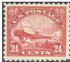
C6 FVF NH SCV $130, net $72.50