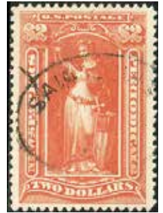
PR120 1896 $2 Periodical issue with great St. Louis oval cancel. Only in use till 1898, not necessarily a Mekeel's usage, but this was during the period when Mekeel's Weekly was based in and mailing from St. Louis. SCV $110, net $65