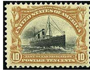
299 FVF NH SCV $325, net $135