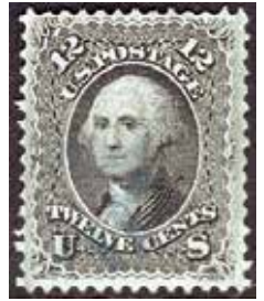
97 Just Fine, 1868 "F" points show, Sharp. Blue very light ccl SCV $260, net $95