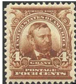
303 XF-Superb LH Beauty XF-S SCV $150, net $95