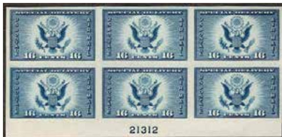
771 FVF NH No Gum As Issued, No Hinge Marks or Wrinkles SCV $55, net $32