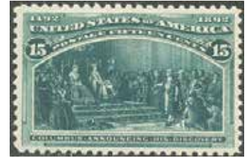
238 FVF LH SCV $200, net $125