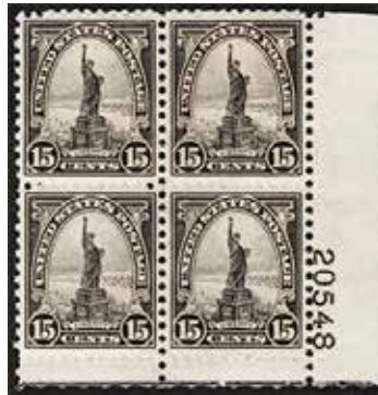
696, VF NH, SCV $55+, net $45.00