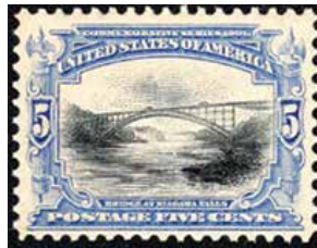
297 FVF NH SCV $180, net $95