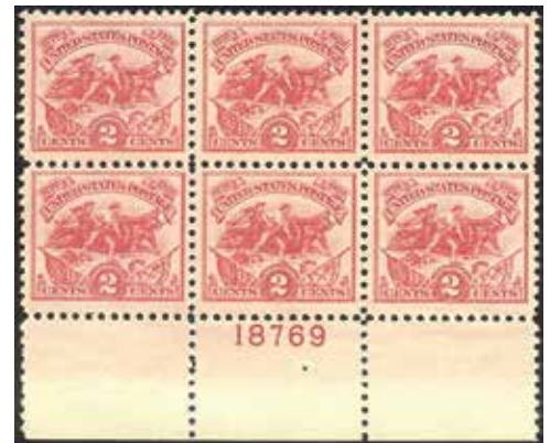
629 Plate Block, FVF NH, SCV $50, net $42.50