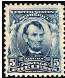
304 FVF LH SCV $60, net $39