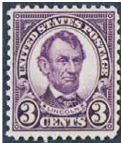
555 FVF NH SCV $27.50, net $12.50