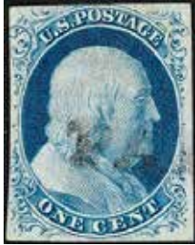
9 FVF, moderate cancel SCV $100, net $49