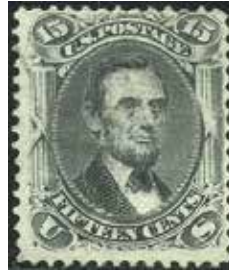
91 Fine, clear of perfs (better than most) light cancel, nice clear grills SCV $575, net $170