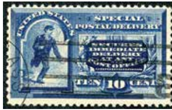
E2 FVF, straight line ccl, bright & fresh SCV $45, net $19.50