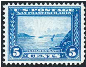
399 Superb LH, Superb SCV $325, net $125