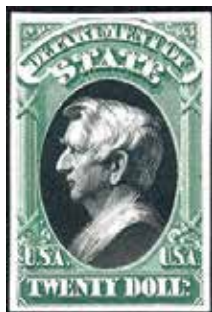
071P4, VF, hinge remnant Stamp Value $2,500 net $65