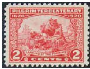
549 XF-Superb NH, Jumbo margins XF SCV $175+, net $125