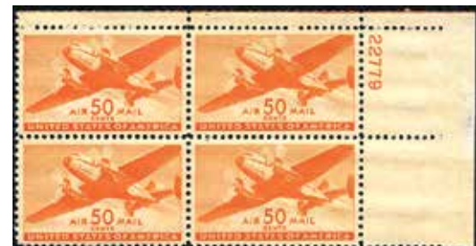
C25-C31 FVF NH set, SCV $81.20, net $39.50 Also available, C31 alone, SCV $47.50, net $26