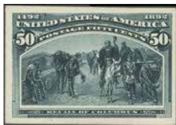
240P4 VF, No Gum As Issued, LH Proof SCV $200. O.G. Stamp SCV $400, net $90