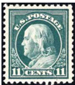
511 VF NH, SCV $17, net $15