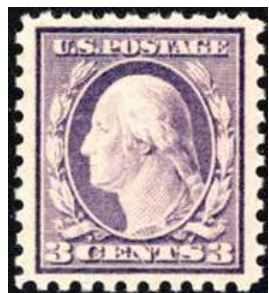
464 XF-Superb NH, Immaculate Gum XF-S SCV $1,100, net $275