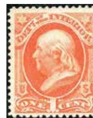
O15, FVF NH, SCV $170, gum skips so priced as LH, SCV $75, net $39