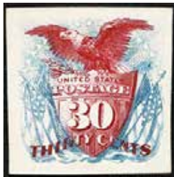
121P4 VF LH SCV $170 Stamp SCV $4,000, net $120