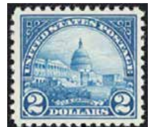
572 FVF+ NH SCV $120, net $69