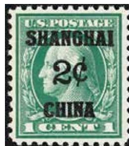
K1 VF NH SCV $67.50, net $52.50