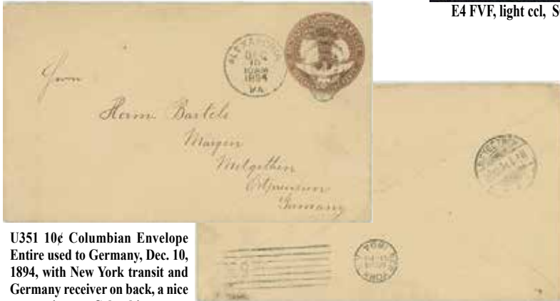
U351 10¢ Columbian Envelope Entire used to Germany, Dec. 10, 1894, with New York transit and Germany receiver on back, a nice companion to a Columbian stamp collection, neatly slit open at top. SCV $75, net $30