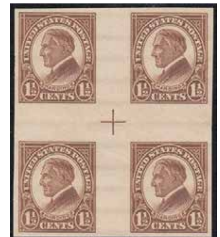
631 VF NH Cross Gutter Block, VF NH, with Gum Ridges, per Scott Standard, SCV $35, net $31