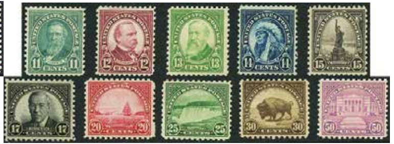
692-701 FVF NH, Fresh, clean set, SCV $137.25, net $75 Also available, 692-700, SCV $87.25, net $35