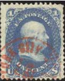
63 Used, Fine+ with great red NY Carrier ccl SCV $80, net $39