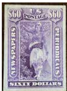
PR32P4, VF LH Stamp Value $6,500 net $36