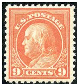
509 VF NH, SCV $25, net $19