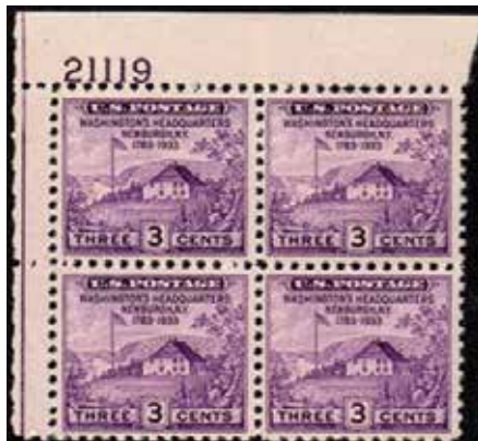
752 Plate Block, excellent centering as many have perfs cutting design, immaculate reverse, Never Hinged, no gum as issued with no signs of prior hinging. SCV $27.50++, net $29