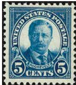
557 VF NH, wide margins SCV $35+, net $24