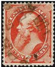
160 VF, Neat town cancel SCV $85, net $42.50