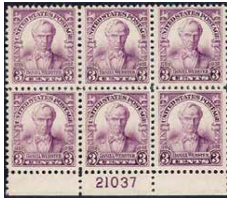
725 Plate Block, FVF+ NH, SCV (undervalued) $20, net $20