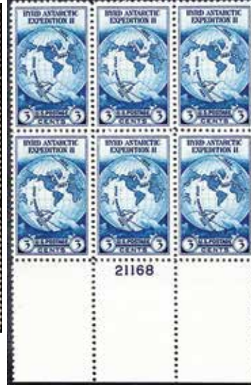
753, VF, No Gum As Issued, No Hinge Marks, huge bottom selvage, SCV $15+, net $15.