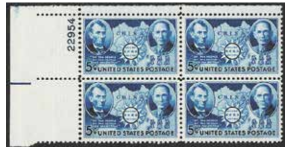
906, VF NH, SCV $22 (undervalued), net $18.50.