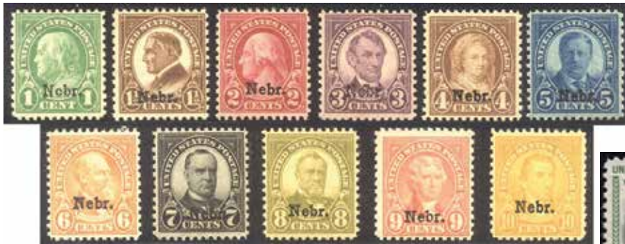
669-79 FVF LH Set, better than most, SCV $265.25, net $145

Limit one single as I want to get the few I have into as many collections as possible