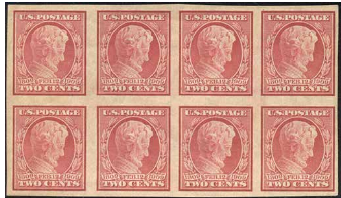
368 Scarce Combination Block: Left block 3mm spacing, right block 2mm spacing VF NH Light natural gum skips, less than usual; SCV $230, net $125