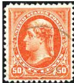
260, FVF, Brought & Fresh, Light Cancel, SCV $140, net $75