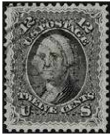
69 Used, XF, light target cancel, Nice clean back SCV $95, XF SCV $325 net $225