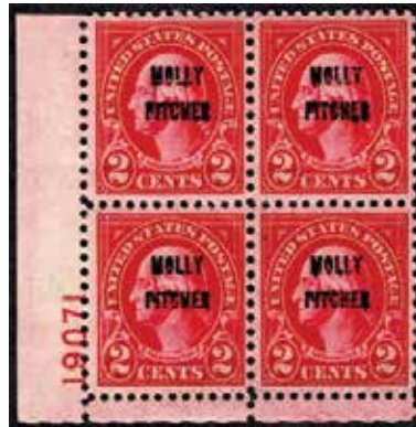
646 Plate Block, FVF NH, Immaculate gum, Light erasure in margin, SCV $52.50, net $19