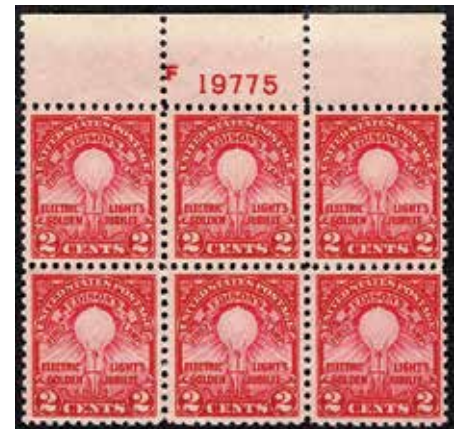
654 Plate Block, FVF+ NH, SCV $40, net $34