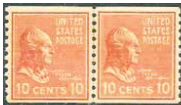
847 FVF NH Line Pair, scv $42.50, net $19