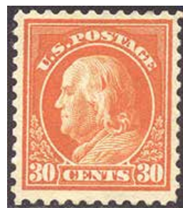
516 FVF NH SCV $70, net $35 Also available, LH $17.50