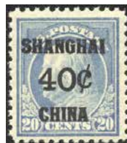
K13 FVF LH SCV $129, net $74