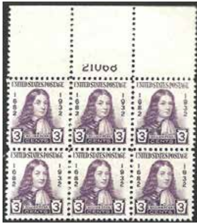
724 Wide Top Plate Block, FVF NH SCV $12.50+, net $11