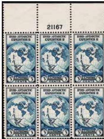
733, FVF NH, wide top, SCV $15+, net $12.50