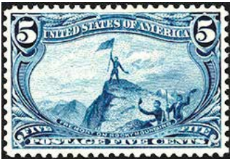
288 VF LH, SCV $100, net $59