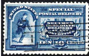
E4 FVF, light ccl, SCV $110, net $39