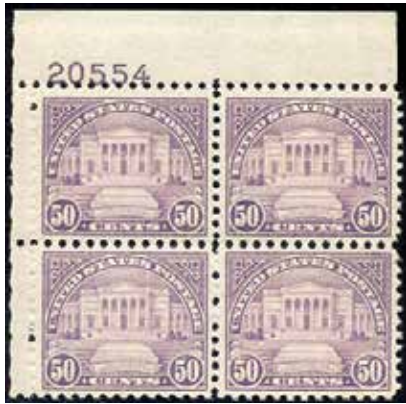
701 Plate Block, Fine-Very Fine, Never Hinged, Full, intact perfs all around, bright color SCV $230, net $155