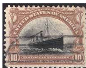
299 FVF, light ccl, fresh SCV $30, net $6.95