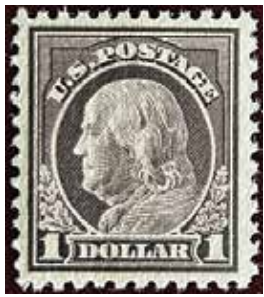
518 VF-XF NH, immaculate gum, full perfs all around, with PSE Certificate grading it VF-XF 85 NH. VF-XF SCV $110, net $90