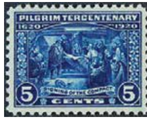
550 XF NH, Wide Margins XF SCV $170, net $125