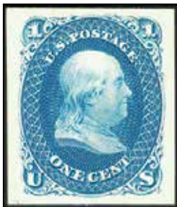
63P4 XF LH, no gum as issued, Stamp SCV $650, Proof SCV $50+, net $59