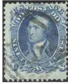
72 Used, Fine, light cancel, 100% Sound SCV $575, net $135