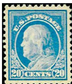
515 Superb LH Superb SCV $245 (XF-S $130), net $95