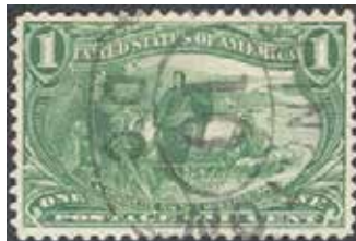
285, Superb, Neat Dbl Oval ccl, Parts of Watermarks in All Four Corners! Superb SCV $900, XF SCV $75, net $39