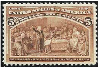
234 VF-XF VVLH, VF-XF SCV $72.50, net $42.50