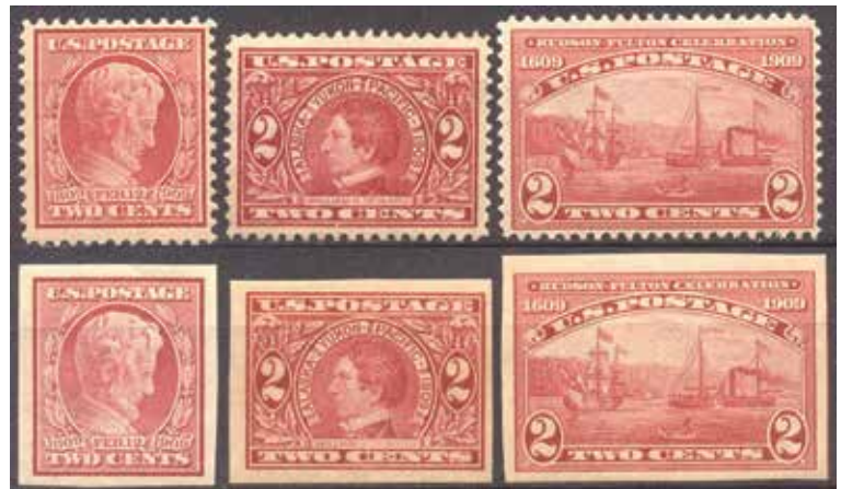
367-68, 370-73 (no 369 Bluish paper), FVF-VF NH, Nice, clean, fresh set (example) SCV $139, net $79