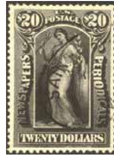
PR123 1896 $20 Periodical issue with great St. Louis oval cancel. Only in use till 1898, not necessarily a Mekeel's usage, but this was during the period when Mekeel's Weekly was based in and mailing from St. Louis. SCV $200, net $85