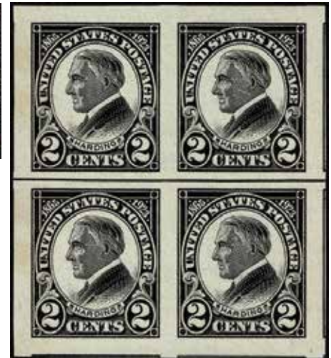
611 Superb NH Jumbo Margins, SCV $130+++ ($758 based pm Singles SCV), net $60