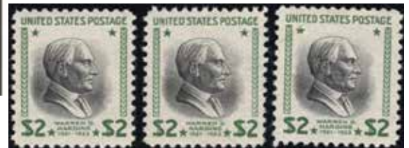
833 VF NH, SCV 16, left or center stamps @ $12 (right stamp corner crease, net $3)