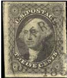
17, VF-XF, Fresh, Moderate ccl, 3 wide margins, Clear all sides, VF-XF SV $325, net $175