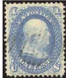
63 Used, Fine+ light ccl SCV $45, net $22