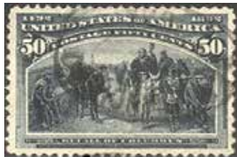
240, VF-XF, moderate ccl, VF SCV $200 VF-XF SCV $300, net $160