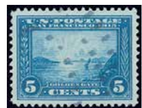
399, XF-Superb, Light Grid of Dots ccl, XF-S $180, net $69

Minimum order $15. Under $40 add $4 for insurance or assume risk. U.S. orders only. Send order & payment to