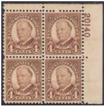
685, FVF NH, SCV $20, net $15.00