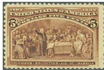
234 Fine NH, SCV $150.00, net $49