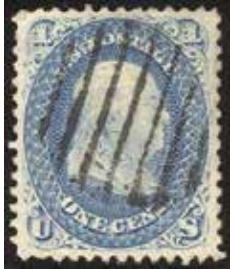
63 Used, FVF grid ccl, light corner crease SCV $45, net $8