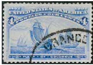
233, XF-Sup, neat c.d.s. XF-Sup SCV $200, net $49