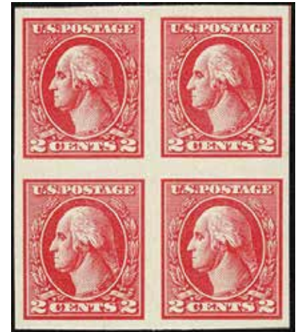
534 XF NH Block, Immaculate gum, strong color, Clear Type Va Identification characteristics XF SCV $160, net $120 (Pairs $70)