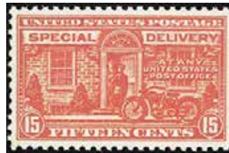
E13 XF NH, XF NH SCV $115, net $85