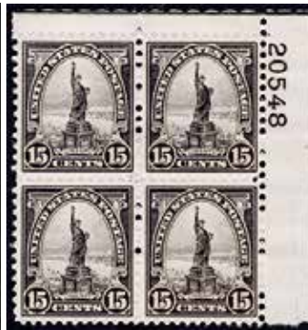
696, FVF NH, SCV $55, net $40.00