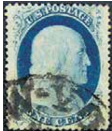
24, VF with $12.50 Scott premium for N.Y. Carrier ccl. SCV $50 net $27.50