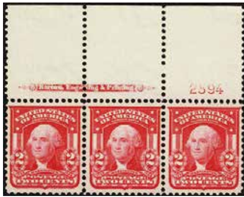
319 FVF NH, Imprint & Plate # Strip, Rich Color, Immaculate gum, Scott $55, net $39