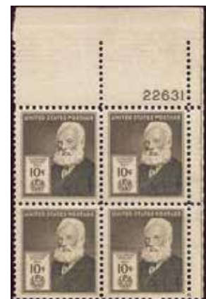
893 FVF NH, Net $24 (sample photo) Also available, complete set, FVF NH, $89