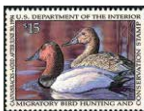
RW60, XF-S NH, XF-S NH SCV $55, net $35