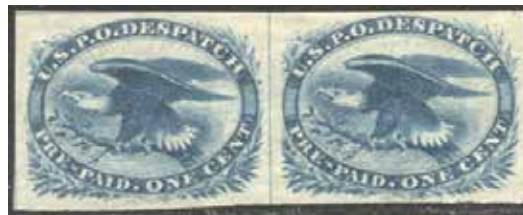
LO2 General Issue Carrier VF NH Line Pair Beauty, No gum SCV $110; RARE NH, so NH conservative estimate c. $220, net $145