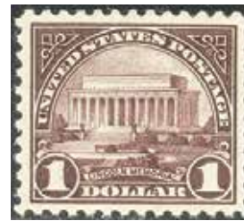
571 XF NH XF SCV $130, net $95