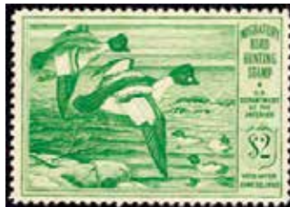
RW16 VF NH, SCV $70, net $45