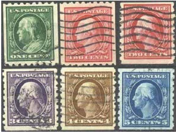
390-396 Used, Very Fine, Nice, Balanced Set, Better Than Most SCV $354, net $145