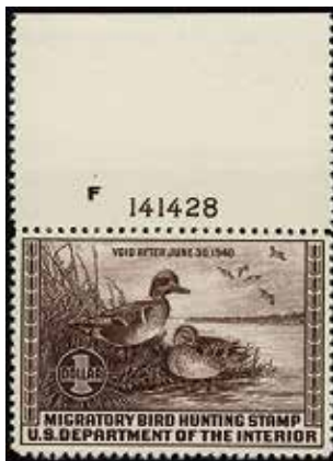
RW6 VF NH Wide Top Plate # Single SCV $250+, net $140.