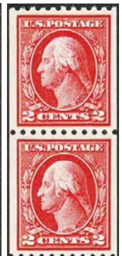
442 VF-XF NH, SCV $55, VF-XF SCV $75, net $49