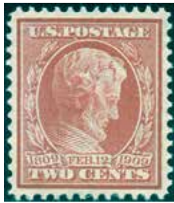
369 XF-S, Very LH Bluish paper, rare this nice XF-S SCV $275, net $225