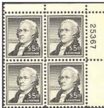
1053 Plate Block, FVF NH, SCV $210, net $135