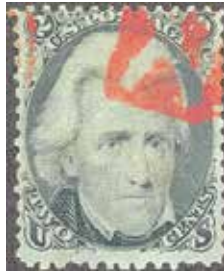
73 Used, Fine, Fancy Red Paint premium cancel, SCV $115, net $45