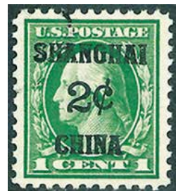
K1 XF-Superb, light ccl, XF-S SCV $425, net $195