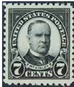
559 XF+ NH, wide margins, XF SCV $45+, net $36