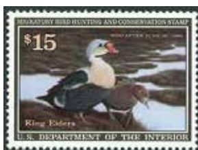
RW58, VF NH, SCV $30 net $19.50