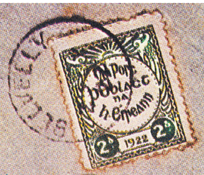
1922 Sinn Fein stamp inscribed "Post of the Republic of Ireland" and used in Cork area when the IRA had control over large parts of Ireland