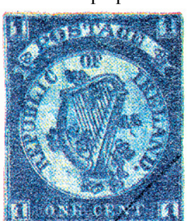
1866 Fenian 'essay'