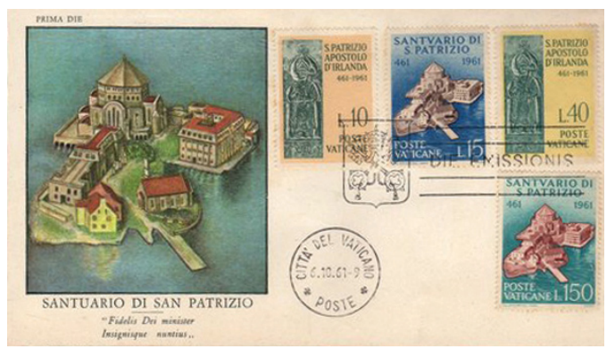
From the Vatican City, a First Day Cover for the October 6, 1961 set, Sc. 313-316, commemorating the 1,500th Death Anniversary of St. Patrick.