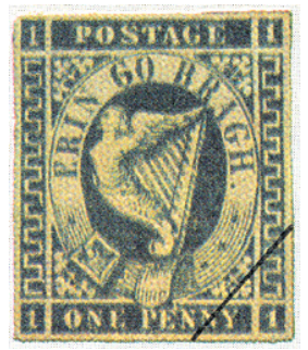
1866 Fenian 'essay

Canadian currency, and is said to have been prepared for