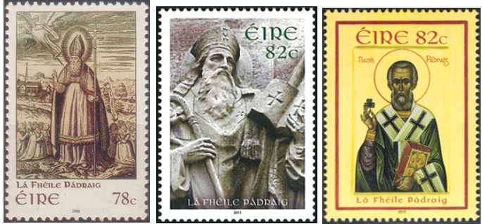
St. Patrick's Day issues, left to right: 2008, Sc. 1769; 2011, Sc. 1912; 2012, Sc. 1952