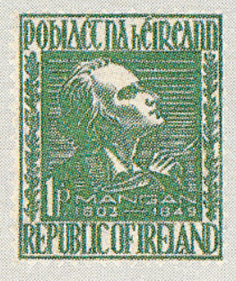
1949 for poet James Clarence Mangan and also inscribed 'Republic of Ireland' (Sc. 141)