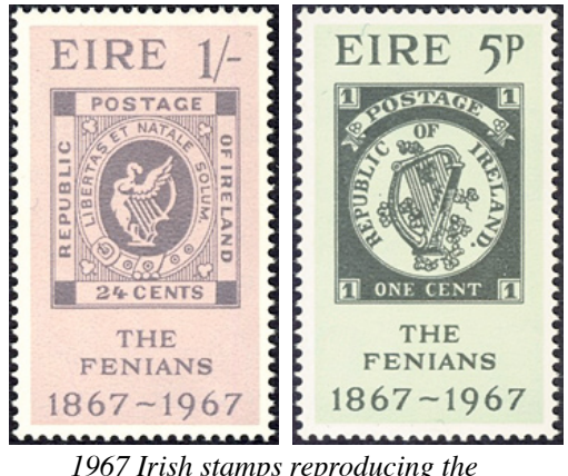
1967 Irish stamps reproducing the Fenian 'essays' (Sc. 238-39)