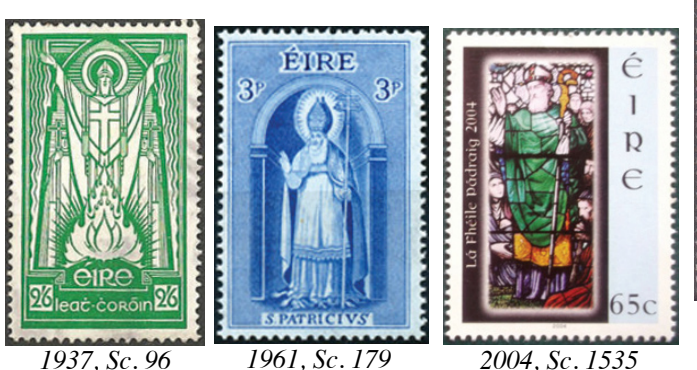
1961, Sc. 179