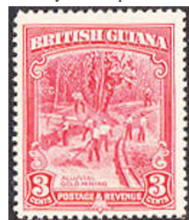
Brit. Guiana 212, gold mining

The chief natural resources of British Guiana are its gold and diamond mines and its timber (Scott 212, 214). Intensive agriculture is carried on only