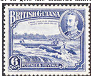
Brit. Guiana 214, shooting logs over falls