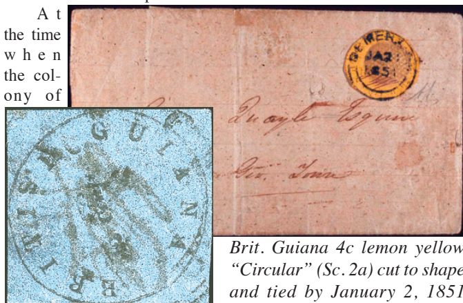
Brit. Guiana 4c lemon yellow "Circular" (Sc. 2a) cut to shape and tied by January 2, 1851 "Demerara" cancel

British Guiana was struggling with its problems of sugar growing and marketing, it began to think about issuing postage stamps. In 1850, three stamps were issued of values 4c, 8c and 12c. The design consisted of a crude circle inscribed with the words "British Guiana" in poorly shaped letters. In the following year the 2c value appeared, of which only ten copies are known to exist. The 2c was issued by order of the Governor and at the request of several merchants of Georgetown for use on letters delivered through the principal streets of the city. This new postal service was not popular, for it was abandoned before the end of the year.