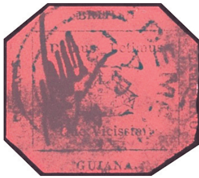
The One Cent Magenta British Guiana, Sc. 13

Although in point of size and commercial importance, British Guiana is essentially a small colony, it holds a high place in the esteem of philatelists on account of the number of rare stamps found among its earlier issues. Not only is it one of the most expensive countries to collect, but it also has the honour of having issued the rarest stamp in the world. This is the 1 cent black on magenta, of 1856, only one copy of which is known. This rare specimen, which reposes in the famous collection of Herr Phillip von Ferrary, of Paris, is without exaggeration the most valuable piece of paper for its size in the world.