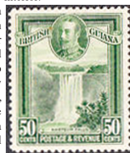
Brit. Guiana 213

The greater part of British Guiana is covered with a dense forest growth intermingled with undulating savannas, or grasslands, and bare tablelands here and there, culminating in mountain ranges to the south. The many rivers afford the only means of transportation into the interior, chief among them being the Courantyne and the Essequibo. On the Potaro, a tributary of the Essequibo, is the beautiful Kaieteur Falls, 822 feet high (Scott 213).