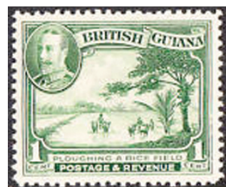
Brit. Guiana 210, plowing rice field