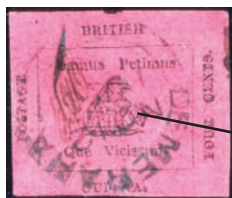
Shown here is the Four Cent Magenta British Guiana 14, from the same set. If you can ignore the thicker, darker lines of the cancel, the ship is barely visible in the center of the stamp (arrow).