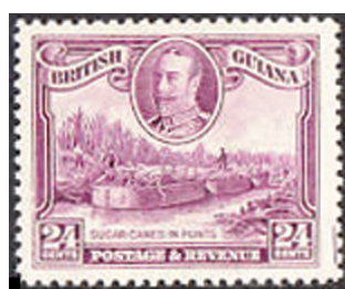
Brit. Guiana 214, sugar cane in punts

One of the first developments of the country was the establishing of sugar plantations along this coast. However, because the markets of Europe at that time were already glutted with sugar from the Dutch and French colonies in Guiana, or were closed altogether, and because of the frequent trouble with the native laborers, the sugar estates up until 1853 became almost non-existent. Today, British Guiana plays a small but important part in the export of cane sugar from the world's "sugar bowl", the Caribbean region.