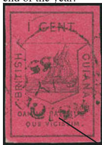
1852 Brit. Guiana 1c, Sc. 6

British Guiana was struggling with its problems of sugar growing and marketing, it began to think about issuing postage stamps. In 1850, three stamps were issued of values 4c, 8c and 12c. The design consisted of a crude circle inscribed with the words "British Guiana" in poorly shaped letters. In the following year the 2c value appeared, of which only ten copies are known to exist. The 2c was issued by order of the Governor and at the request of several merchants of Georgetown for use on letters delivered through the principal streets of the city. This new postal service was not popular, for it was abandoned before the end of the year.