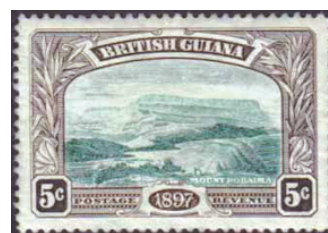
Brit. Guiana 154

cancellation of the death sentence passed upon him by King James I, searched in vain through the almost impenetrable forests and was put to death upon his return to England. The Indians told these early explorers that on the flat top, 8,620 ft. Mt. Roraima (Scott 152-154), there were glittering boulders of