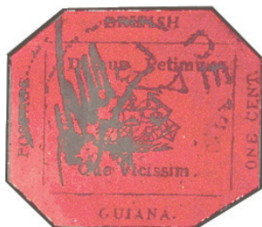
Brit. Guiana 13