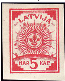
Redraw, Sc. 3