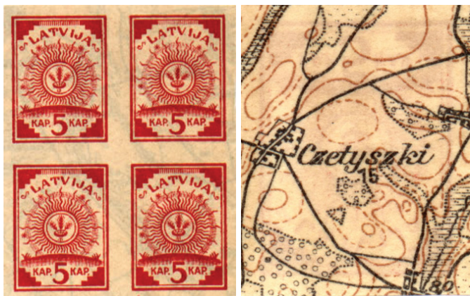
Block of four of Latvia Sc. 1, showing the map on the back; this is from a specialized study of this issue at http://www.apsit.com/mapintro.htm

The first issue of stamps was on December 19, 1918, and was printed in Riga by Schnakenburg. The only paper available was the military maps that had been made in the same printery a few months previously, so sheets of 228 were fitted to the backs of these maps.