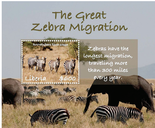
Liberia featured Zebra.

Late last year the Inter-Governmental Philatelic Corp. orchestrated a series of issues for some of its client postal administrations on the subject of “equids”—in this case, Horses, Zebra, Donkeys and Wild Jackasses.