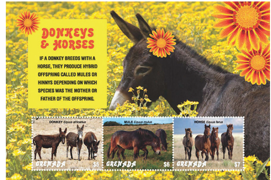
Grenada pictured Donkeys and Horses.

Interestingly, there was another member of the family of which horses are the most popular part—the Ox; however, the stated subject of the issue is those little birds—oxpeckers—neatly perched on the huge animal. On the souvenir sheet from Liberia, they are seen lounging, rather than performing their productive task of eating ticks, small insects, and other parasites on the ox.