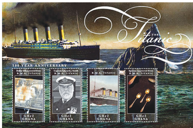
Ghana sheetlet, Sc. 2697, issued September 7, 2012

For them, we turned to the website of the Inter-Governmental Philatelic Corp., www.igpc.com . One of the leading philatelic agents, representing many nations, IGPC often focuses on popular topical issues. We present a sampling, and refer you to www.igpc.com to view many additional Titanic issues.