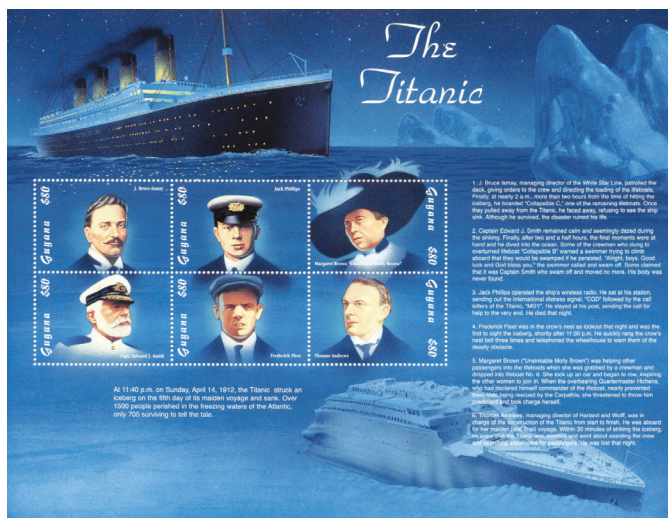
Guyana, Sc. 3307, issued June 17, 1998