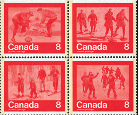
Canada 644-647, Winter Activities: Curling, Snowshoeing, Skiing, Skating

mate is cold in winter and warm in summer, but healthy all the year round. With all its extremes of cold it permits of the cultivation in the open air of grapes, peaches, tobacco, tomatoes, and corn. The snow is an essential condition of the prosperity of the timber industry, the means of transport in