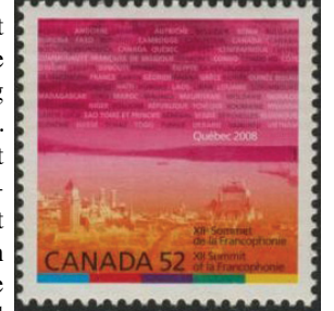
Canada 2290: 2008 Francophone Summit, Quebec

The French Canadians are almost exclusively the descendants of the French in Canada in 1763, there being practically no immigration from France. The French language is by statute, not by treaty, an official language in the Dominion Parliament and in Quebec, but not now in any other province, though documents, etc., may for convenience be published in it. English is understood almost everywhere except in the rural parts of Quebec, where the habitants