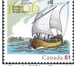
Canada 2156a: Champlain exploration

Samuel de Champlain, who had visited the country in 1603 and 1604, founded the city of Quebec. Meantime French settlements were made in what is now the maritime provinces, but known to the French as Acadia. France claimed, as a result of this settlement, exclusive control of the whole immense region from Acadia west to Lake Superior, and down the Mississippi to the Gulf of Mexico. But the control of this region was not uncontested. England claimed it by right of prior discovery, based mainly on the discovery of Newfoundland in 1497 by John Cabot.