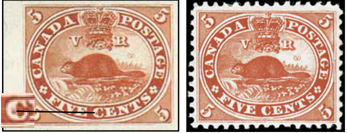
Left, 5¢ brown red proof on India on card, with dot in C; right, Sc. 15 variety with no dot

In laying down the impressions on the plate or plates for the 5\phi value a guide dot was applied to the transfer roll. This occupied such a position that as each succeeding impression was applied to the plate it fell so that the guide dot would fall about the centre of the C of CENTS. Consequently, the vast majority of these stamps show a conspicuous dot of color in the position indicated. The stamps without the colored dot are, usually, those from the extreme left vertical row of the sheet.