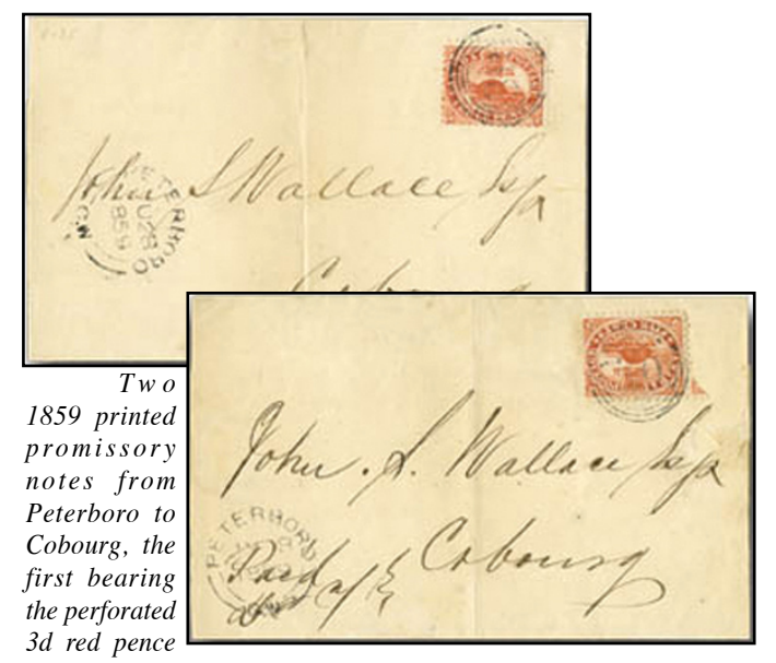
issue (Sc. 12) tied by a numeral "30" four-ring cancel on cover prepaying the old 3d letter rate, with June 28 Peterboro c.d.s., only a few days before the currency change [July 1]; the second bearing a 5¢ vermilion (Sc. 15) tied by "30" with July 8 c.d.s. prepaying the new 5¢ domestic letter rate mailed only a few days after the currency change.

The 1c differs from the 1/2d only in the words denoting the value below the portrait. The 5c differs from the 3d not only as regards the