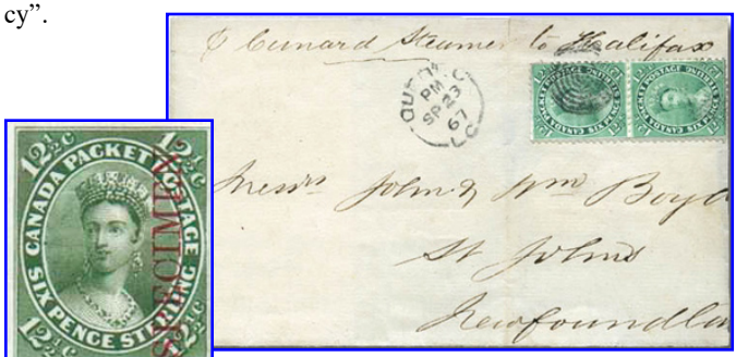
Left, 1859, 12-1/2¢ yellow green Specimen plate proof on India paper (Unitrade 18Pi); right, 12-1/2¢ blue green (Sc. 18a) tied by concentric rings cancels on 1867 cover to St. John's, Newfoundland, "Quebec L.C., SP 23 '67" origin c.d.s.

The 12-1/2¢ differs from the 7-1/2d only as regards the corners where "12-1/2¢" replaces the former values of "6d. stg" and "7-1/2d