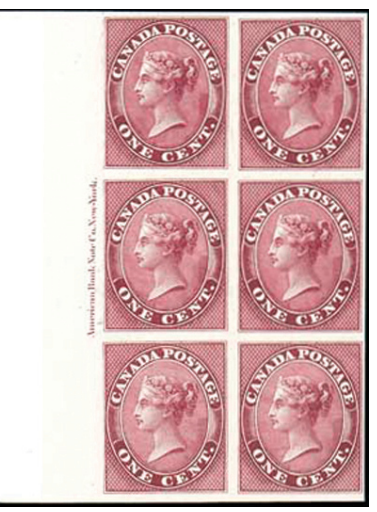
1859 1¢ deep rose trial color plate proof on India (Sc. 14P) left margin block of six with "American Bank Note Co., New-York." imprint.

The stamps were printed in sheets of 100 by the line-engraved process the manufacturers' imprint, "American Bank Note Co., New York" appearing twice in each margin in very small letters. For some reason or other no imprint was applied to the plate for the 17¢ value.