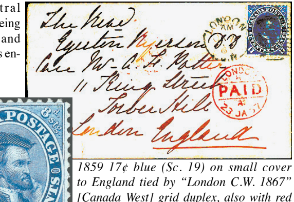
[Canada West] grid duplex, also with red London [England] "Paid". An example of the single 17¢ rate per Royal Mail Steamer (Cunard Line).

the central portions being retained and new orders engraved.