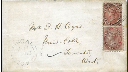
Canada, 1864, Queen Victoria, 2¢ rose (Sc. 20, top), with slightly overlapping 1¢ rose (Sc. 14), each canceled by concentric-rings on cover to Toronto, Ont., with matching "Fingal C.W., JU 1 1868" c.d.s. (lower left)

We are surprised that a different hue was not chosen for the 2 cents, and should imagine its great similarity to the 1 cent, should the latter not be withdrawn from circulation, would tend to create confusion.