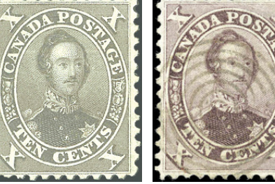
Left, 10¢ black brown, Sc. 16; right, 10¢ red lilac, Sc. 17 (See our front cover for color images)

With the exception of the 10\phi the stamps of this issue provide but little variation in shade but the 10\phi more than makes up for this lack in the others for it exists in almost every conceivable tint from bright red-lilac through