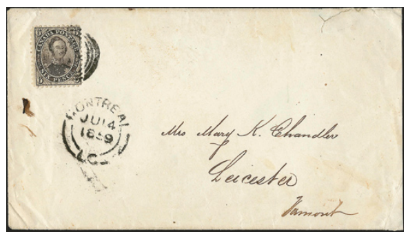
CANADA, 1859, 6p brown violet perf 12 (Sc. 13) tied by target "Montreal JU 14, 1859" double-circle datestamp paying the single cross-border rate on a cover to Vermont

course—i.e., that the manufacturers should perforate the stamps—was the one followed.