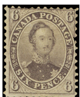
Left to right: 1858 1/2p rose perforated, Sc. 11; 1858 3p red perforated (Sc. 12); 1859 6p brown violet perforated (Sc. 13)

From the above statement, one would naturally