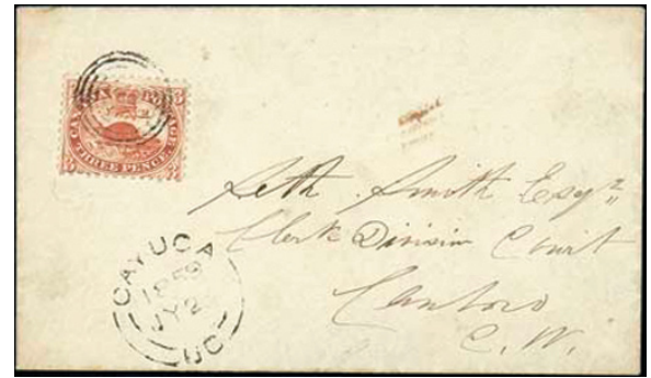
1859 3p red (Sc. 12) tied by neat target cancel on small cover to Canboro, C.W. [Canada West], postmarked with a "Cayuca, U.C. [Upper Canada], 1859, Jy 26" split-ring c.d.s.