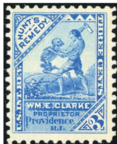
Left: San Francisco Match Co. on silk paper, Sc. RO165; right, Hunt's Remedy Medicine stamp, Sc. RS56

serving to advertise the firms that issued them. Many of these can still be had for a few cents each