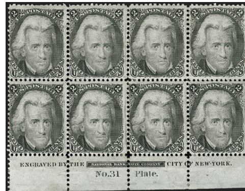
Sc. 73 in a plate block of 8

sassinated on April 14, 1865 (just as the Civil War was ending) and to honor the martyred President his portrait in black was used on the first fifteen cent stamp, issued for use upon the introduction of the new registration fee in 1866. This stamp is generally considered as the first United States commemorative. Other Presidents similarly honored by mourning stamps have been Garfield (brown color) and McKinley, Harding and Wilson in black.