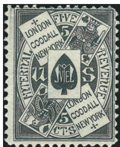
Left: Baird's Bloom of Youth Perfumery stamp on pink paper, Sc. RT14c; right, Goodall Playing Cards stamp on old paper, Sc. RU8a

and no Civil War collection can be considered complete without a representative showing.