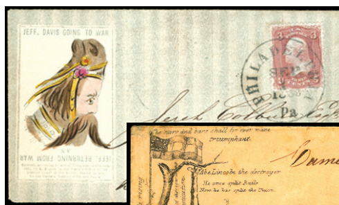
Two 'less positive views': positive: a Jefferson Davis "Jackass" cover from the Union side—turn it upside down and it pictures a jackass; and a "Hanging Lincoln" cover from the Confederate side.

Add to this series the two cent black profile of Jackson, with the curious topknot, resembling an Indian headdress and issued in 1863-64.