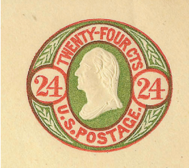
1861 24¢ corner, Sc. U44

The envelope stamps of the Civil War period consist of the series of 1861, distinguished by outline letters and with the higher denominations from 12 to 40 cents bicolored (rare and high priced).