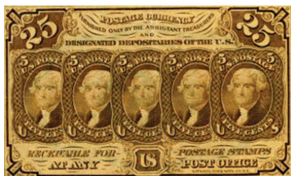
Front and back of Sc. PC7, the 1862 25¢ Postage Currency with 5 x 5¢ stamp facsimiles.

brown; on the ten cent denomination, one ten cent Washington stamp in green and on the twenty-five and fifty cent denomination the five cent and ten cent stamps are drawn over-lapping