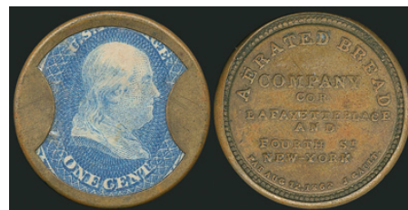
Sc. EP1, 1¢ encased postage issued by the Aerated Bread Co.

their names on the back in embossed letters. Small copper "tokens" with a value of one cent were extensively issued by private firms and to take care of this pressing necessity for change the Government issued "Postage Currency" under the Act of July 17, 1862.