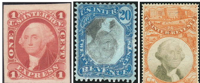
Left to right: 1862 First Issue proof, Sc. R1P4; 1871 Second Issue 20¢, in this case with the black center inverted, Sc. R111a; 1872 Third Issue $20, Sc. R150.

very rare. In our generation the Red Cross performs on battlefield and in hospital many of the functions inaugurated in the Civil War with funds raised by the Sanitary Fairs.