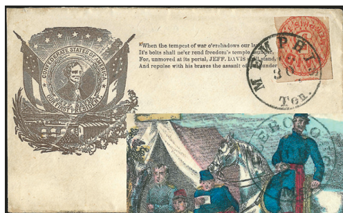
Two positive Patriotics: Jefferson Davis honored on a cover with the Memphis 5¢ Provisional, Sc. 56X2; and a Magnus Patriotic Camp Scene design with the 3¢ Sc. 65 stamp tied by a fancy cancel. See next column for two additional examples.

Although the main varieties of Confederate postage stamps are not too numerous, their collection is a specialty in itself and one requiring a rather deep pocket book.