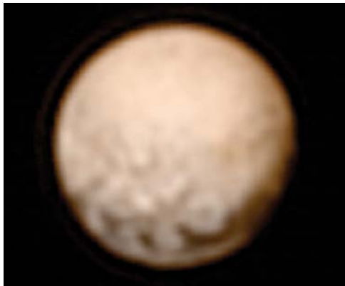
A NASA colorized photo of Pluto as taken by the New Horizons spacecraft on July 3, 2015 at a distance of 8.3 million miles.

It was not until January 19, 2006—some 9.5 years ago—the piano-sized New Horizons was launched on a journey that culminates with the orbit of Jupiter.