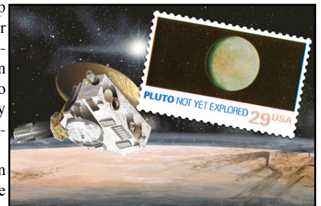
A NASA work showing the New Horizons spacecraft adjacent to the stamp.