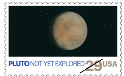
The Pluto stamp, Scott 2577